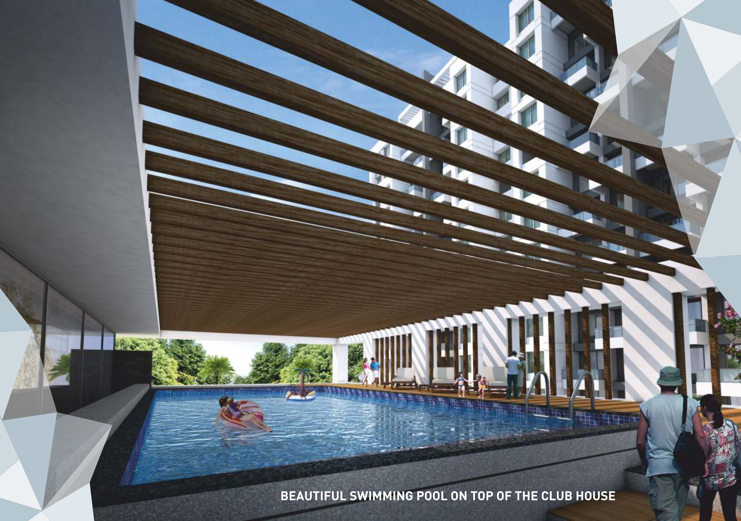
BEAUTIFUL SWIMMING POOL ON TOP OF THE CLUB HOUSE