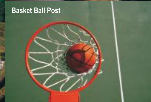
Basket Ball Post