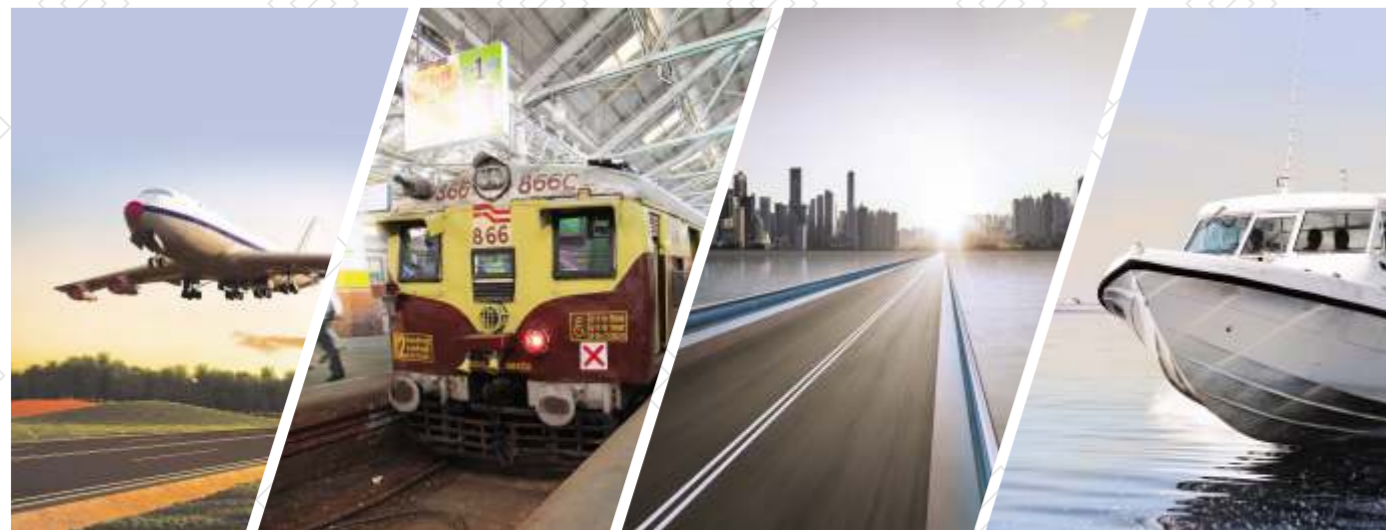
NAVI MUMBAI AIRPORT 10 MIN.