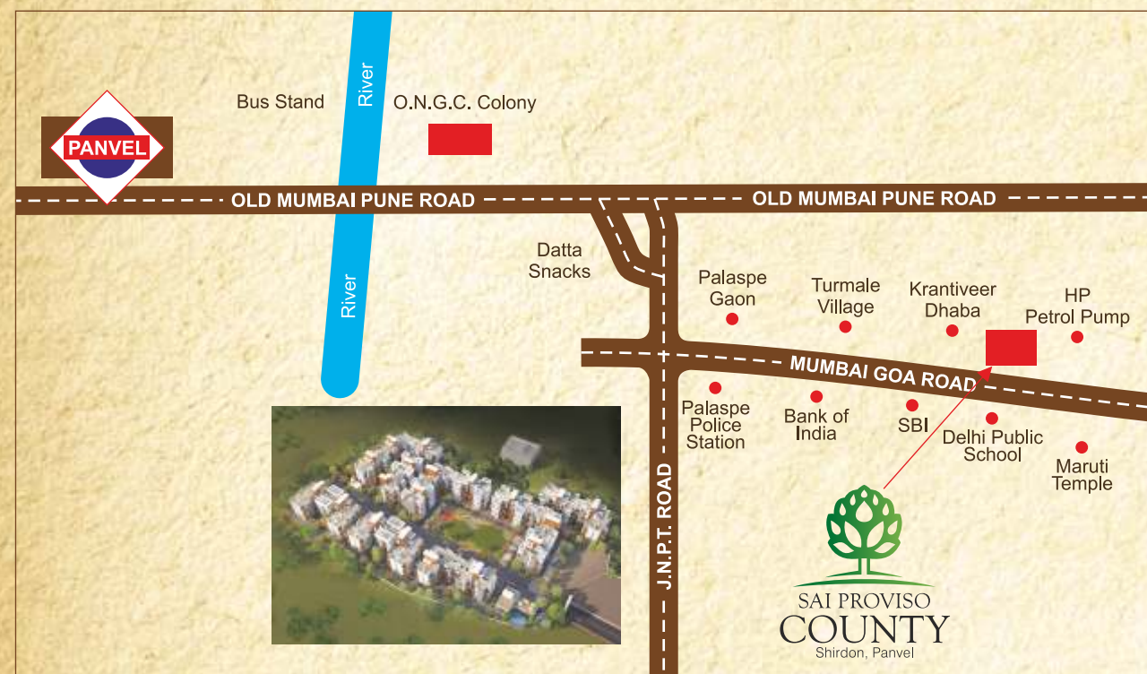
Location Map (Not to scale)

Site Add.: Plot No. 154/1, 154/3, 162/3, 188/2, Village - Shirdon, Taluka - Panvel, Dist. Raigad.