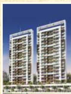
SAI PROVISO AASHLESHA Koparkhairane