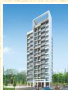
PROVISO GREEN Kharghar