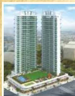
GREEN WOODS Kharghar