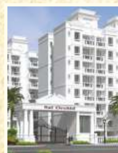
SAI ORCHID PHASE 1 Dombivali East