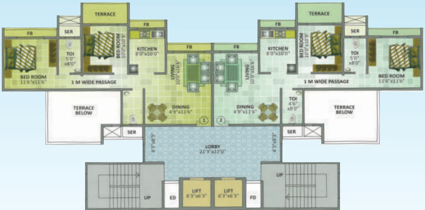
5th, 8th, 11th, 14th, 17th Floor Plan