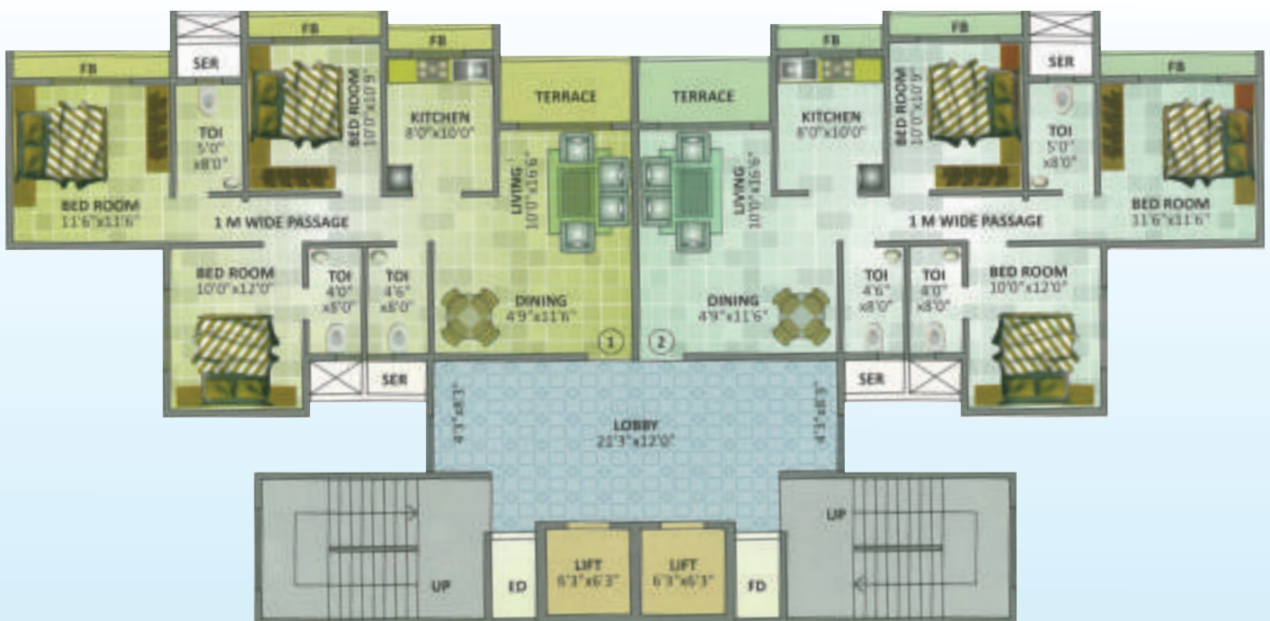
18th Floor Plan

Clubhouse, Swimming Pool And Landscaped Garden On Second Floor | Grand Entrance Lobby | Air - Conditioned Gymnasium | Sturdy And Grand Society Main Gate | High Capacity Elevators Of Reputed Brand With Power Backup | Good Quality Plaster Paints On Exterior Of Building | Neatly Interlocking Paving In Compound | Earthquake Resistant Structure