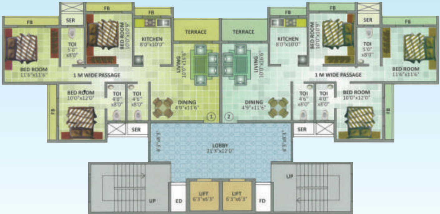
3rd, 6th, 9th, 12th, 15th Floor Plan