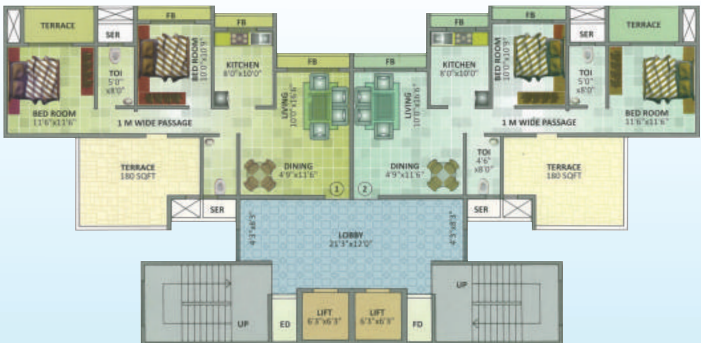
4th, 7th, 10th, 13th, 16th, 19th Floor Plan

A Complex of 2 G+19 storeyed residential building | 3BHK, 2BHK Terrace & 2BHK Flats Excellent Living Spaces | Perfect Amalgamation Of Architectures Technique & Planning Specially Designed Spaces Blended With Luxury & Lifestyle | Ample Car Parking On Stilt & First Floor