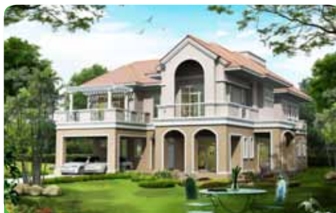
Paradise - 34 - 6532