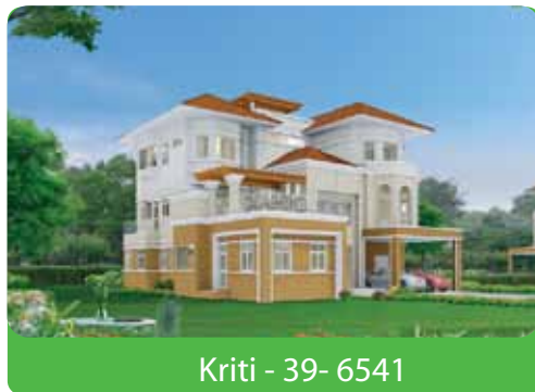
Kriti - 39 - 6541

Other Conditions – Stamp Duty, VAT & Service Tax are applicable as per the market rate at the time of registration