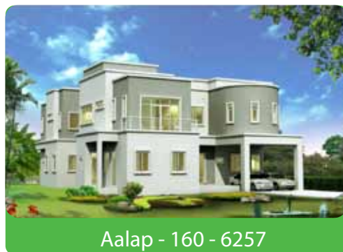
Aalap - 160 - 6257