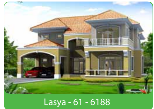
Lasya - 61 - 6188