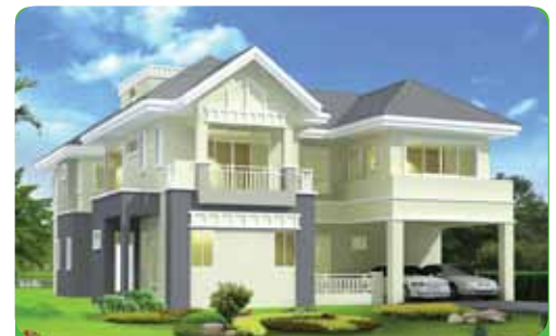
Dhanya - 9 - 6000