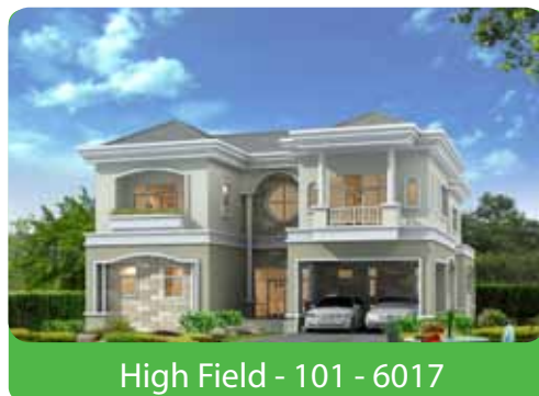
High Field - 101 - 6017