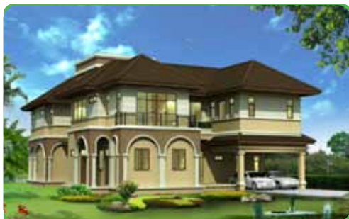
Akriti - 3 - 6356