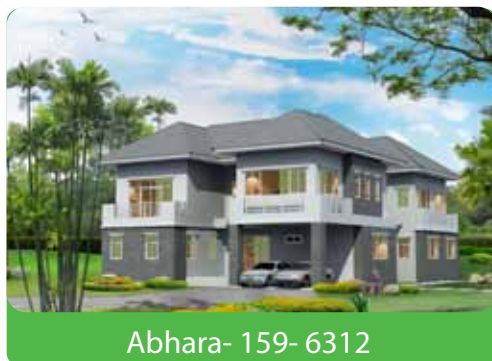
Abhara - 159 - 6312