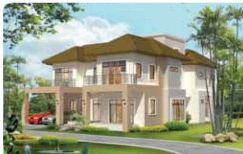
Amerthyst - 7 - 6420