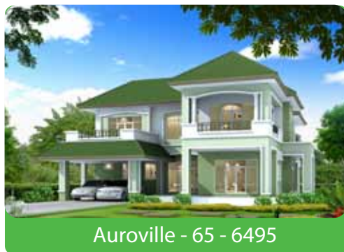
Auroville - 65 - 6495