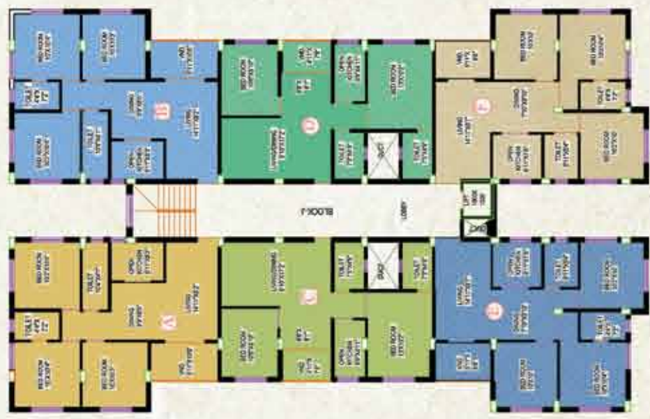
Typical Floor Plan of Block - J