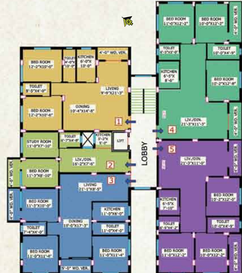
Typical Floor Plan of Block - D