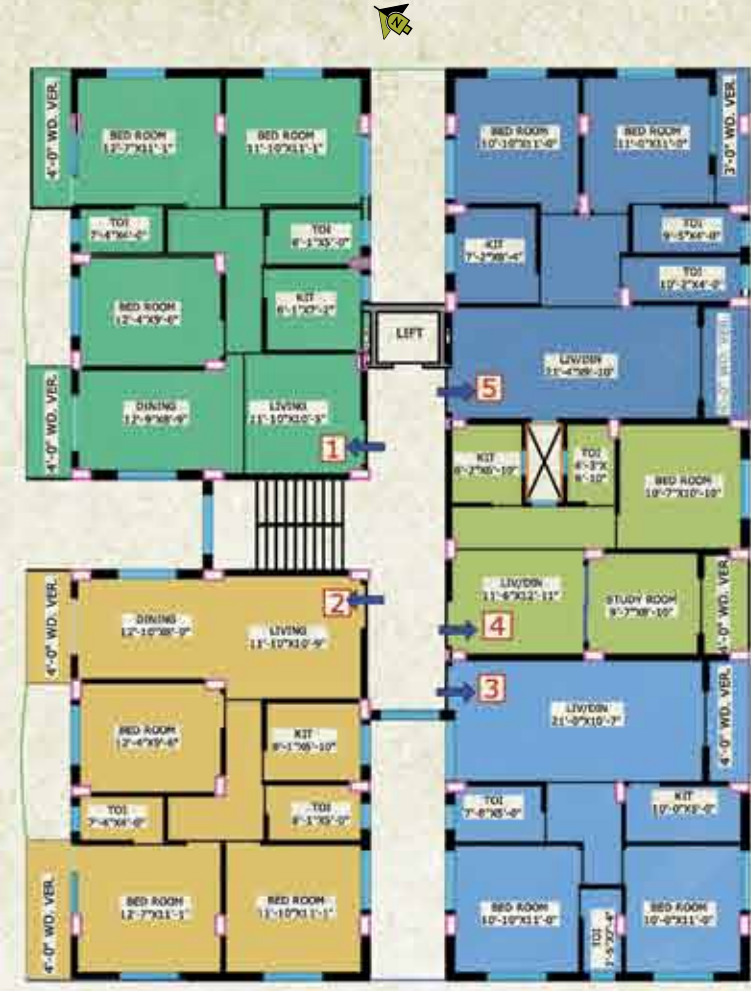
Typical Floor Plan of Block - C