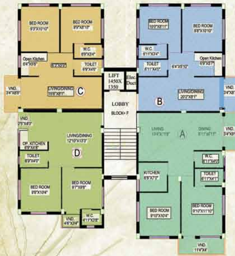
Typical Floor Plan of Block - F