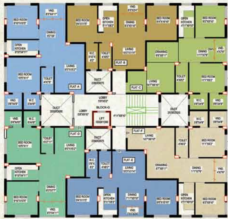
Typical Floor Plan of Block - G