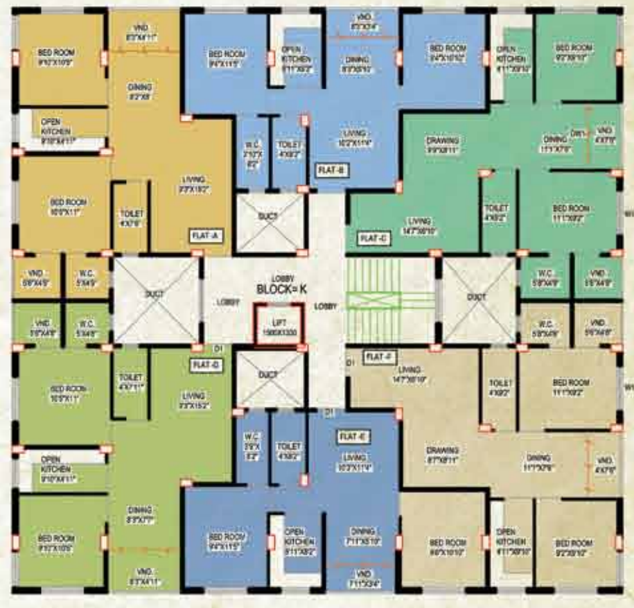
Typical Floor Plan of Block - K