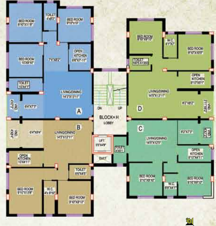
Typical Floor Plan of Block - H