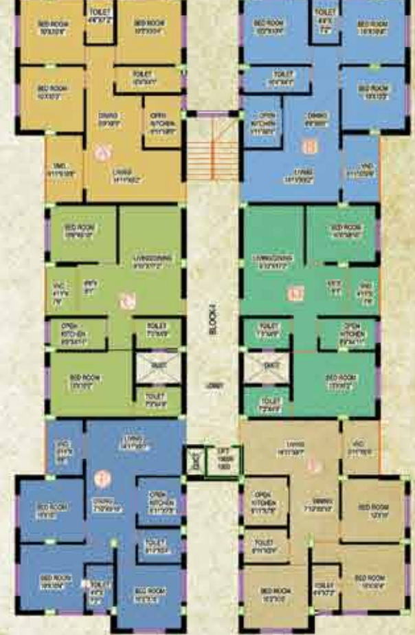
Typical Floor Plan of Block - I