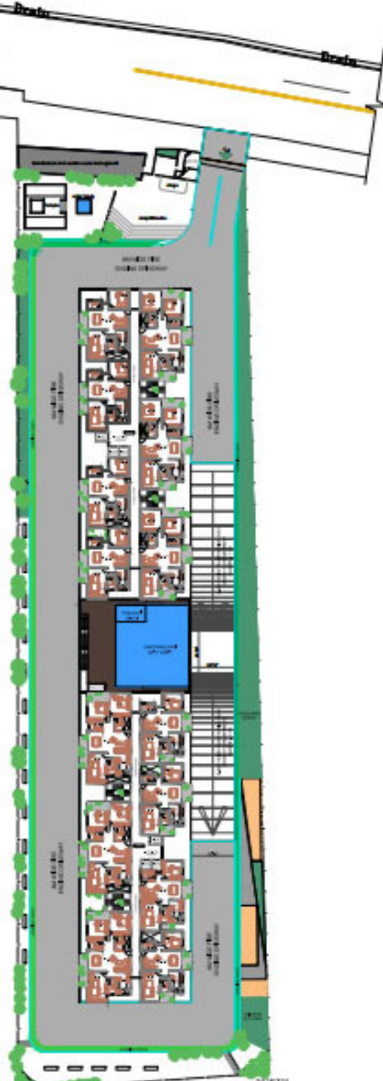
MASTER PLAN NORTH SQUARE