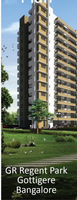
GR Regent Park Gottigere Bangalore