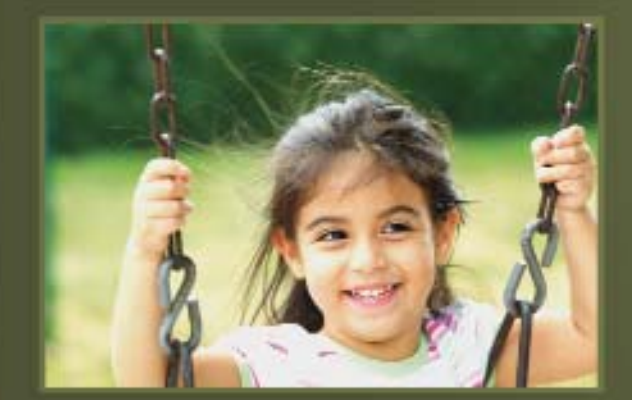
Outdoor children's' Play Area