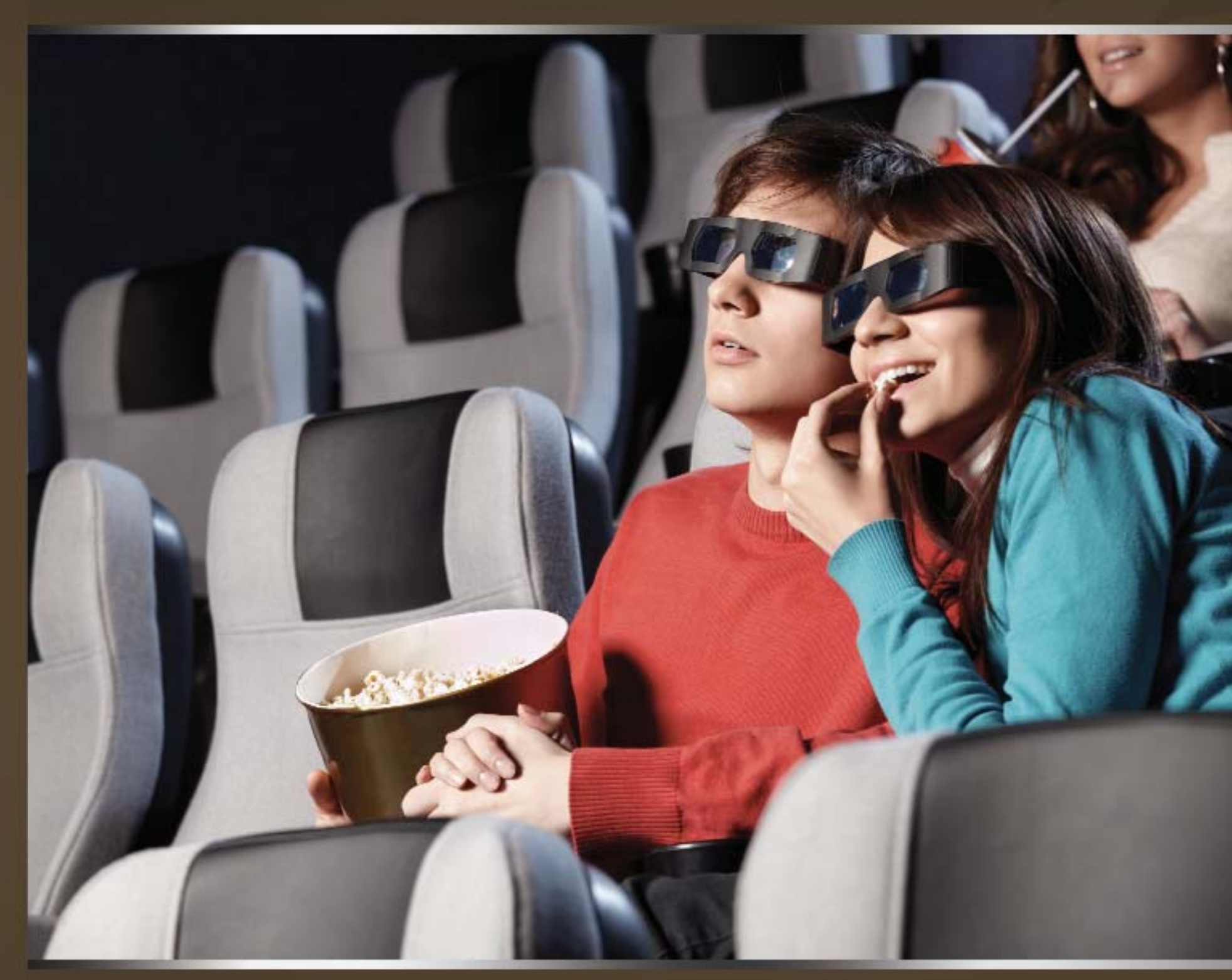
Enjoy large screen movie experience in your own private Mini Theatre.