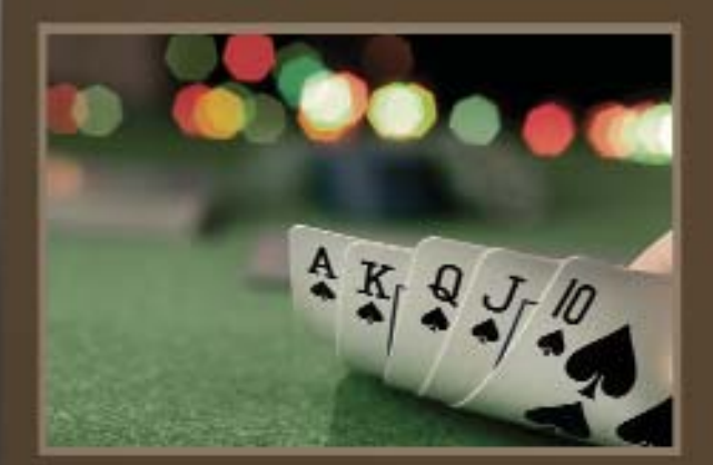
Dedicated Cards Room