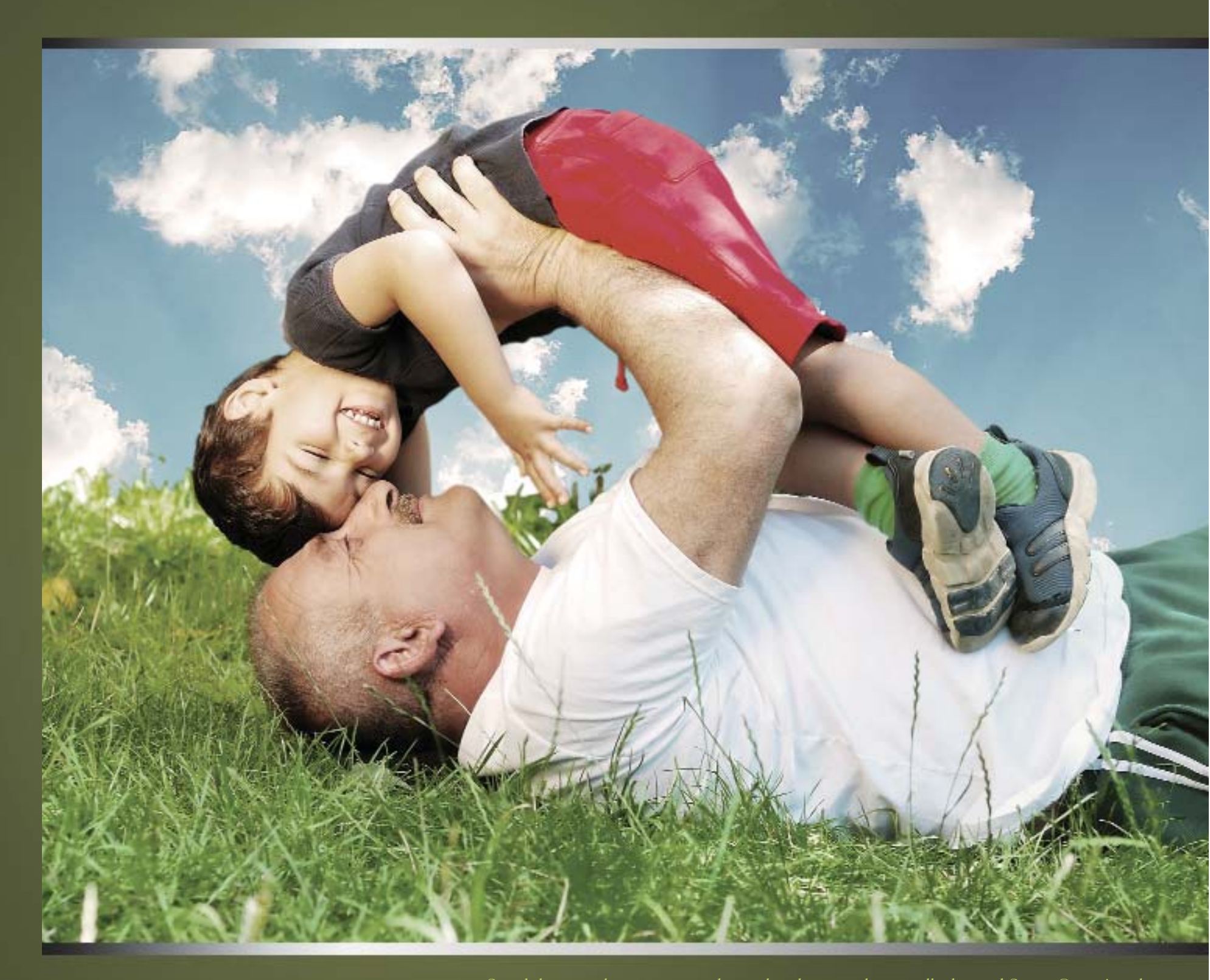
Spend those timeless moments with your loved ones at the specially designed Senior Citizen's park.