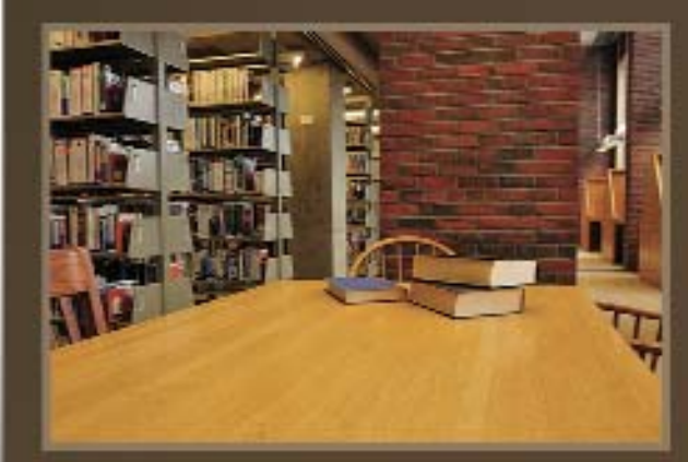
Well equipped Computer Room cum Reading Room