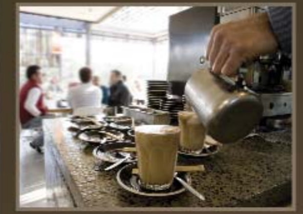
The exhilarating Club Cafeteria