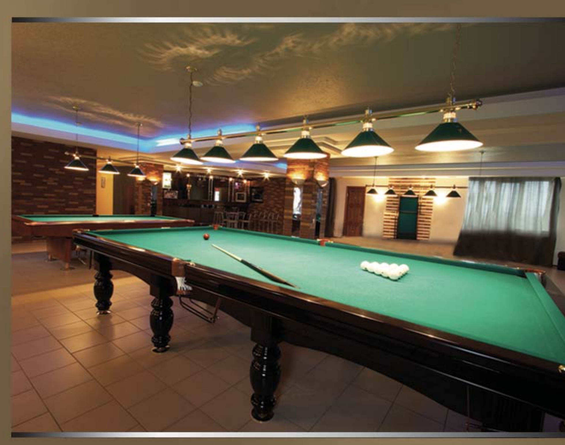
Inwind after a hard day's work with a quiet game of Billiards or Pool with your friends, right inside the club facility