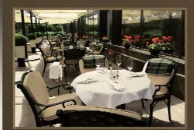
Alfresco Dining overlooking the garden