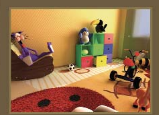
Play Room exclusively for kids