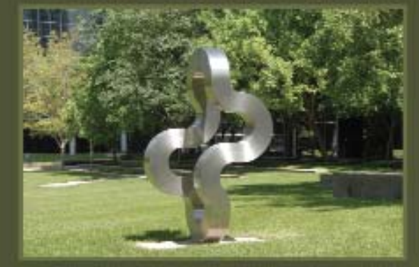
Aesthetically designed sculptures in Central Greens