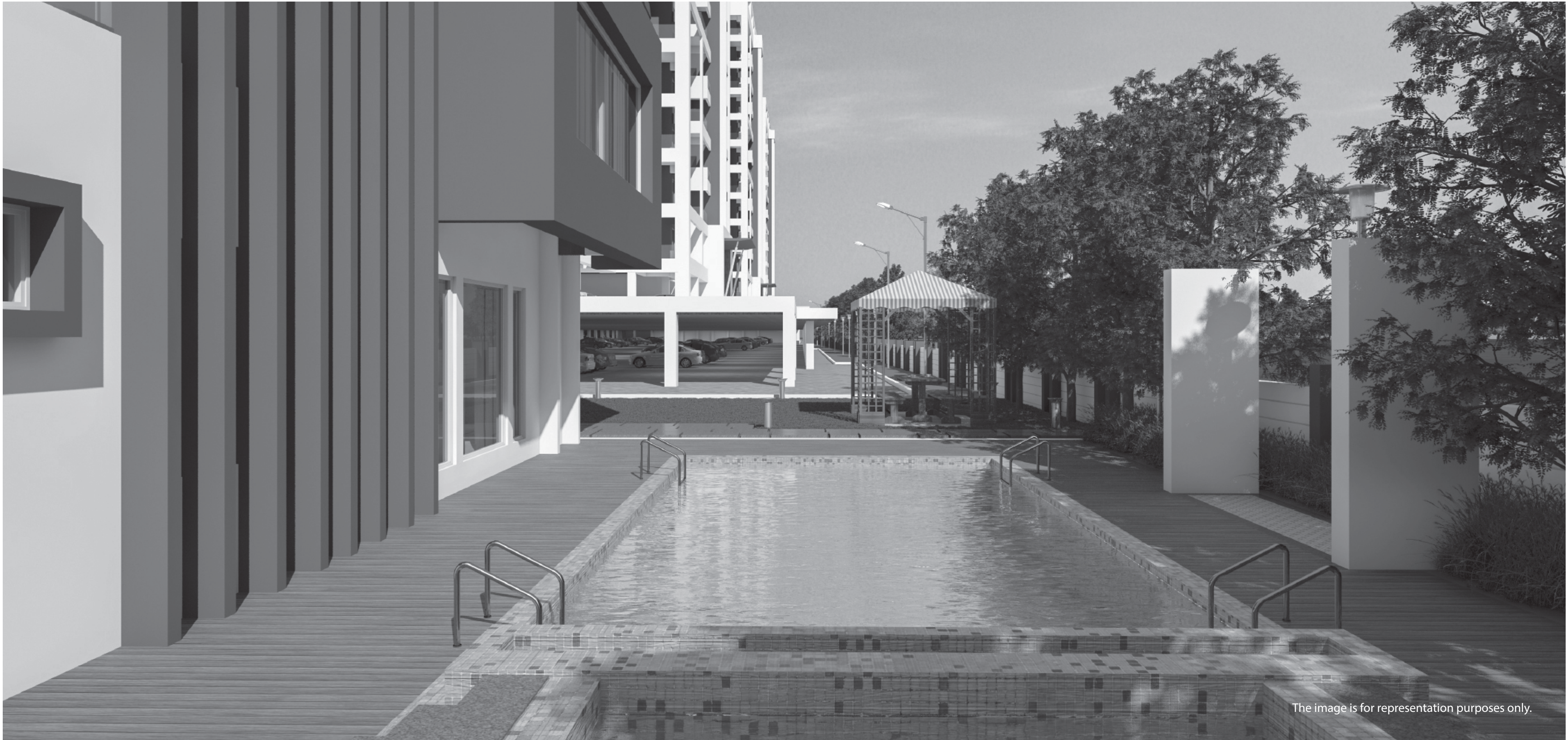
The image is for representation purposes only.