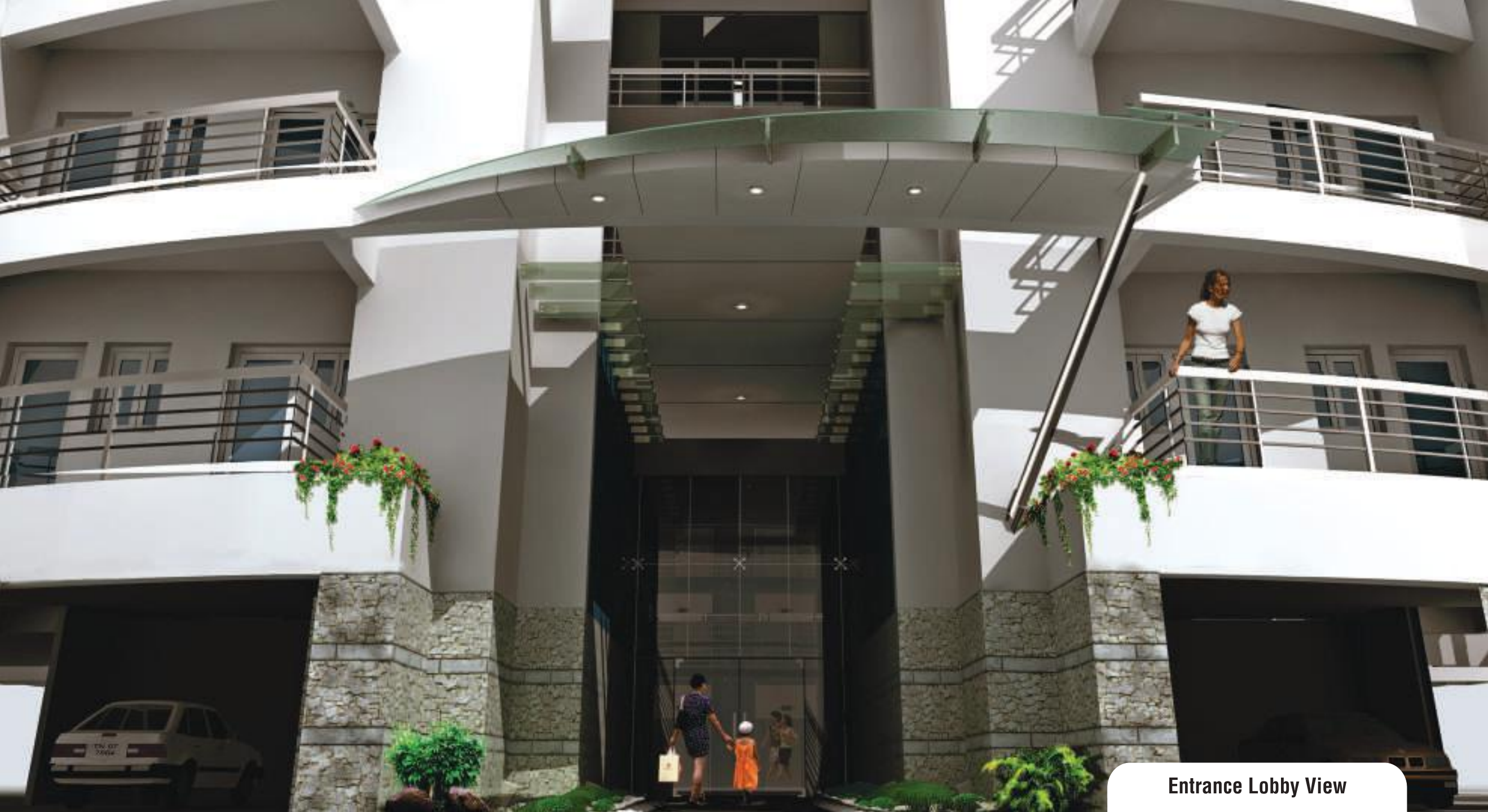
Entrance Lobby View

Glazed portals invite the play of light in all its iridescence. Charting out structure around radiance has a scintillating welcome effect that showcases unrestrained space. Even the untrained eye is bound to appreciate the ingenuity carved into the structure.