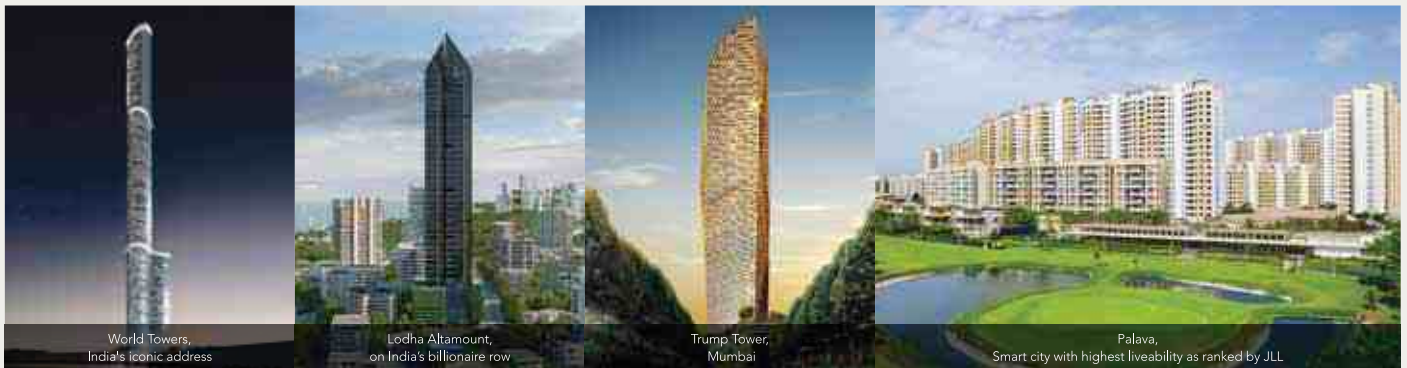
World Towers, India's iconic address