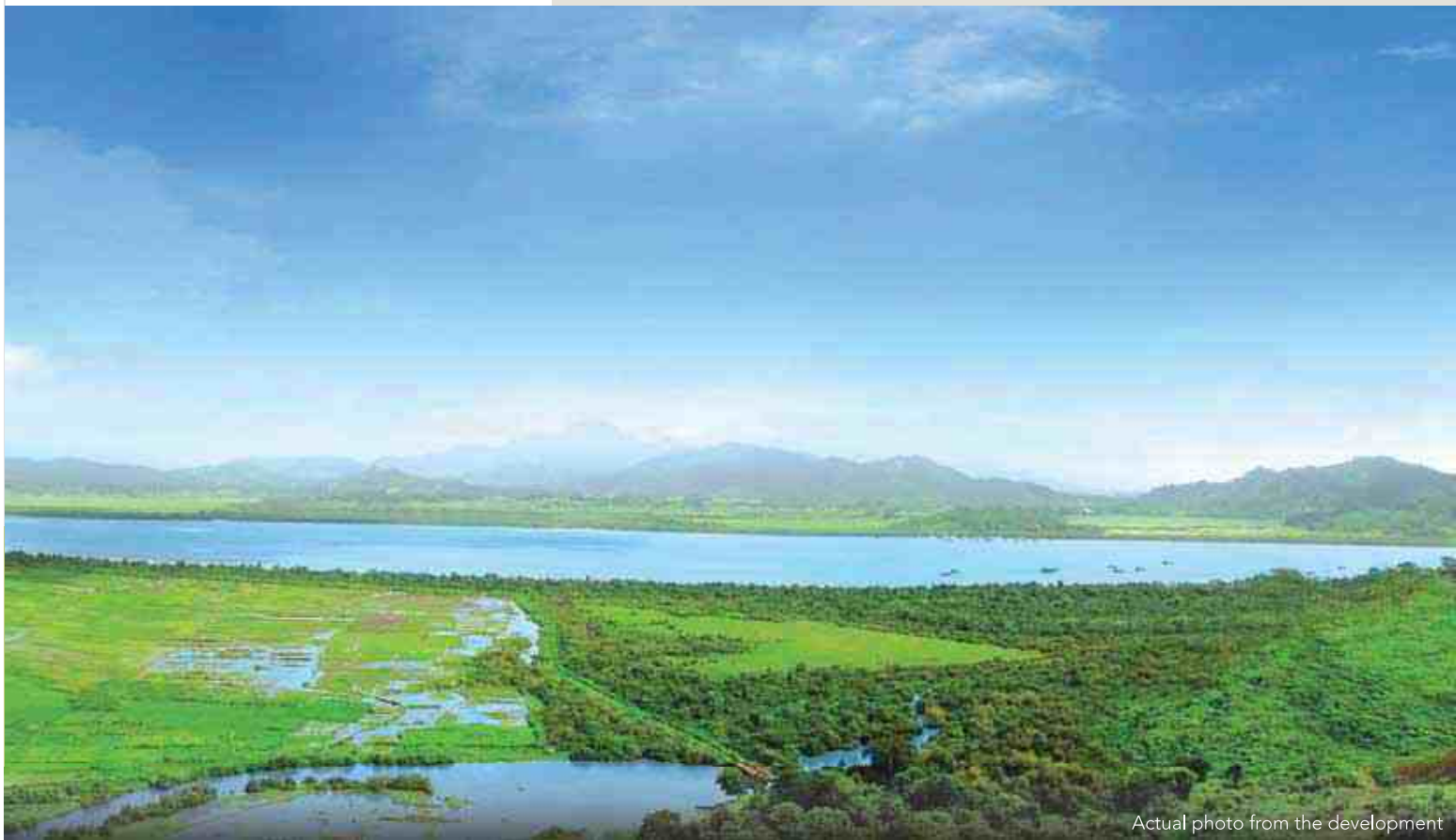
Actual photo from the development

Expect the unexpected. Believe in the unbelievable.