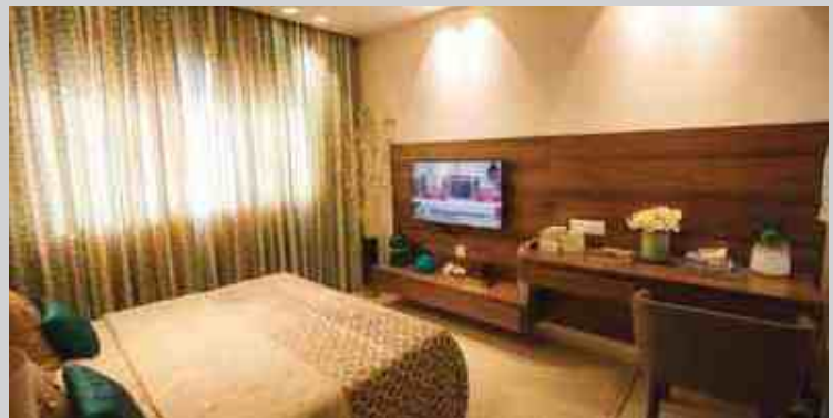
All images shot on location