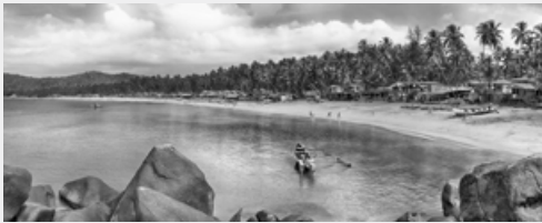
Sea Meditating at Sunset, Vagator Sea, Sand, Rocks and Shacks