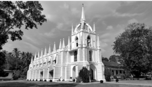
Faith Church of Our Lady of Immaculate Conception, Panaji Mae De Deus Church, Saligao