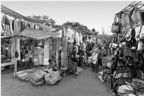
Sun Kite Surfing, Ashwem beach Night Market, Vagator