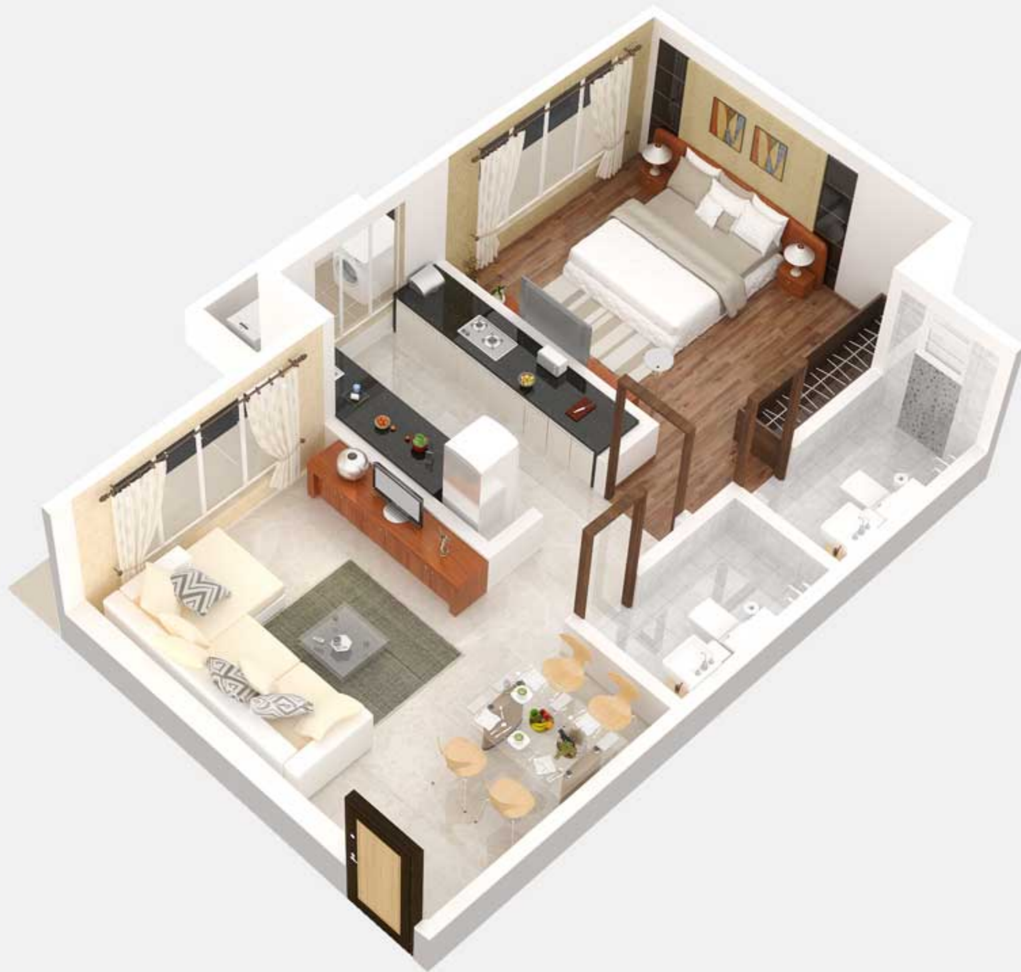
Isometric plan 1 BHK (Type A)