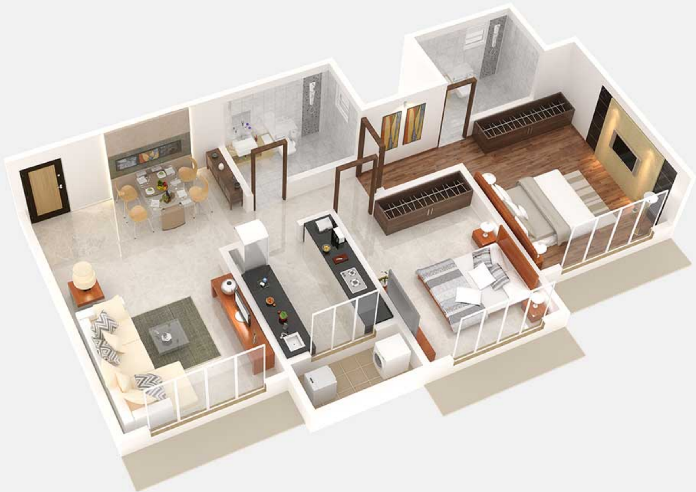
Isometric plan 2 BHK (Type B)