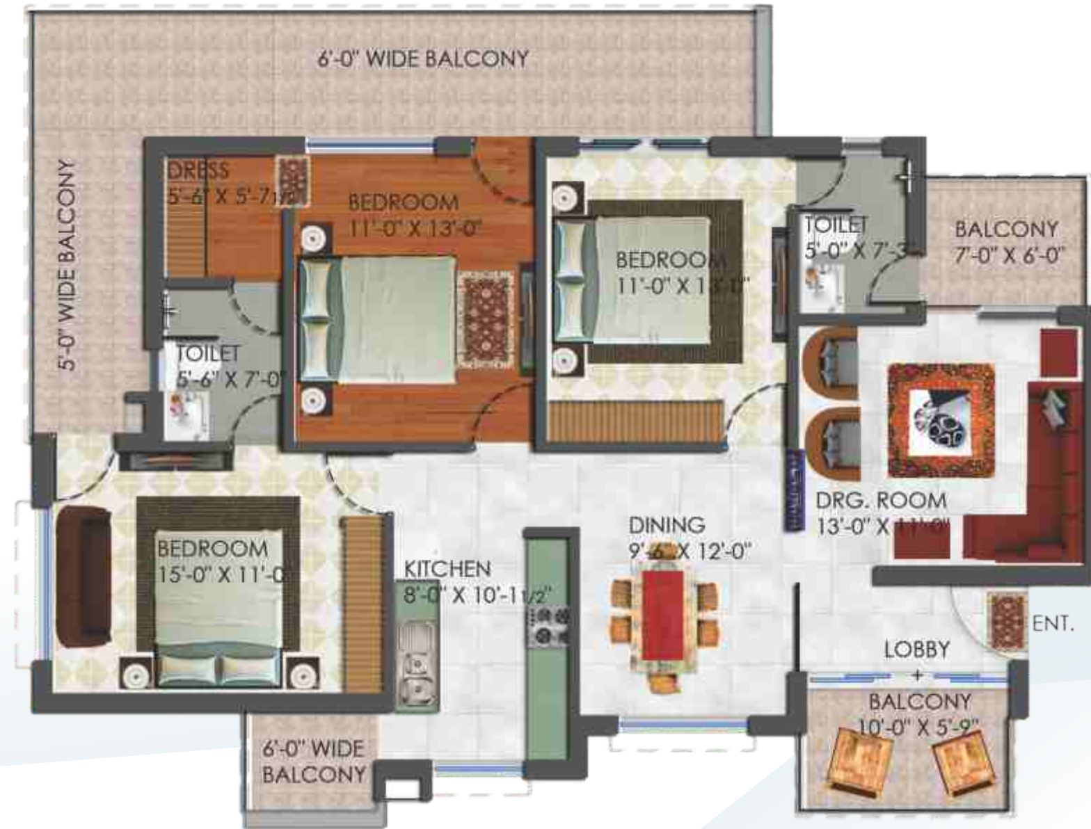
Three Bed Room Apartment Super Area: 1663 sq.ft. (Approx)