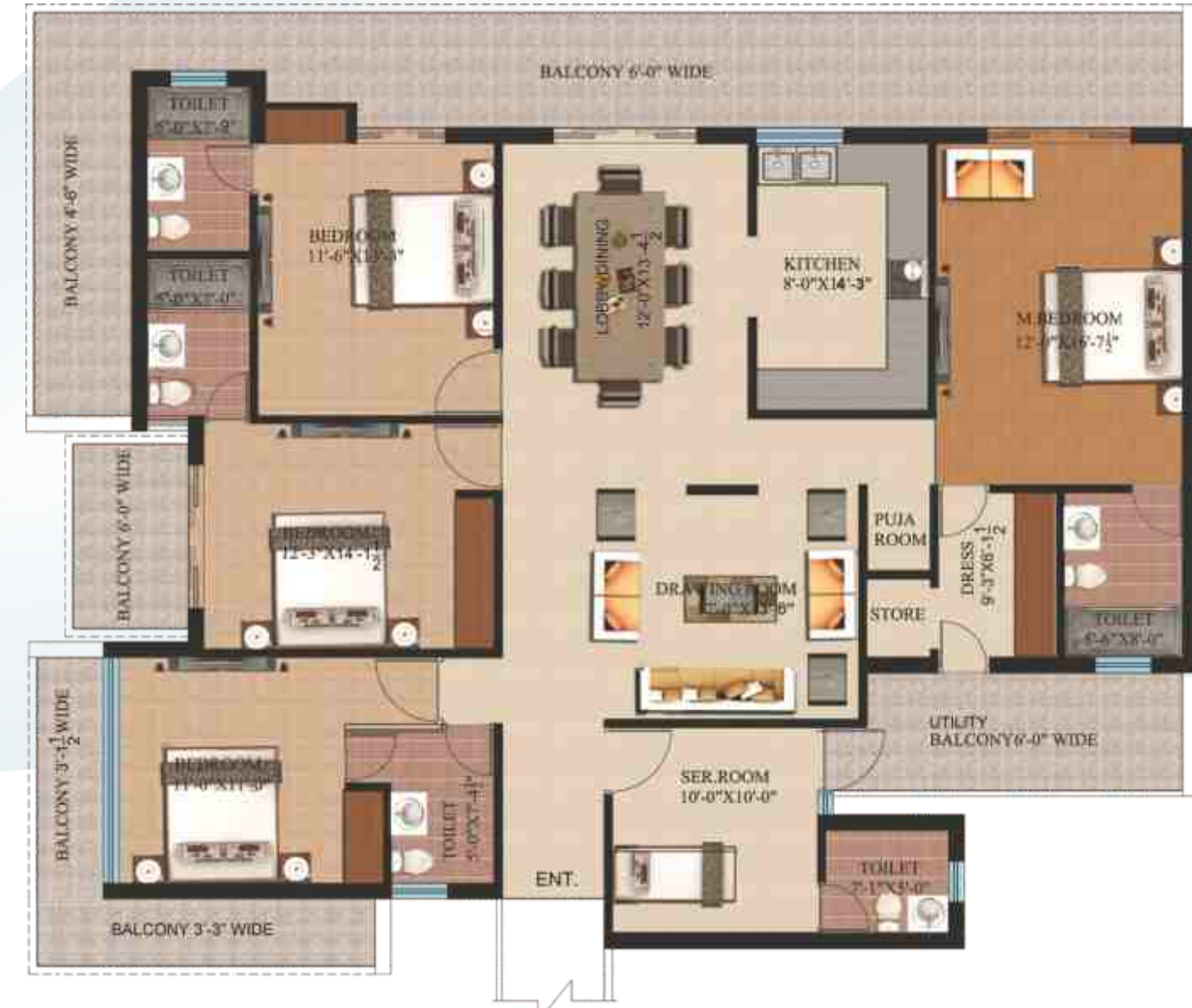
5 Bedrooms+ 5 Bath + Drawing & Dining + Kitchen + Store + Puja Room + Balconies Super Area: 2630 sq.ft. (Approx)