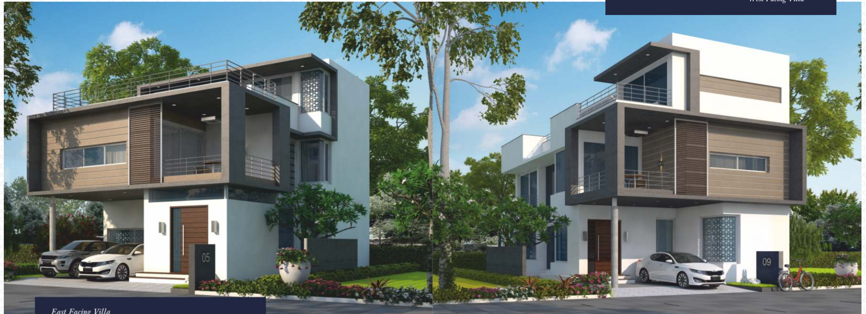
East Facing Villa

Refreshing, Contemporary and minimalistic design with clean and simple lines.