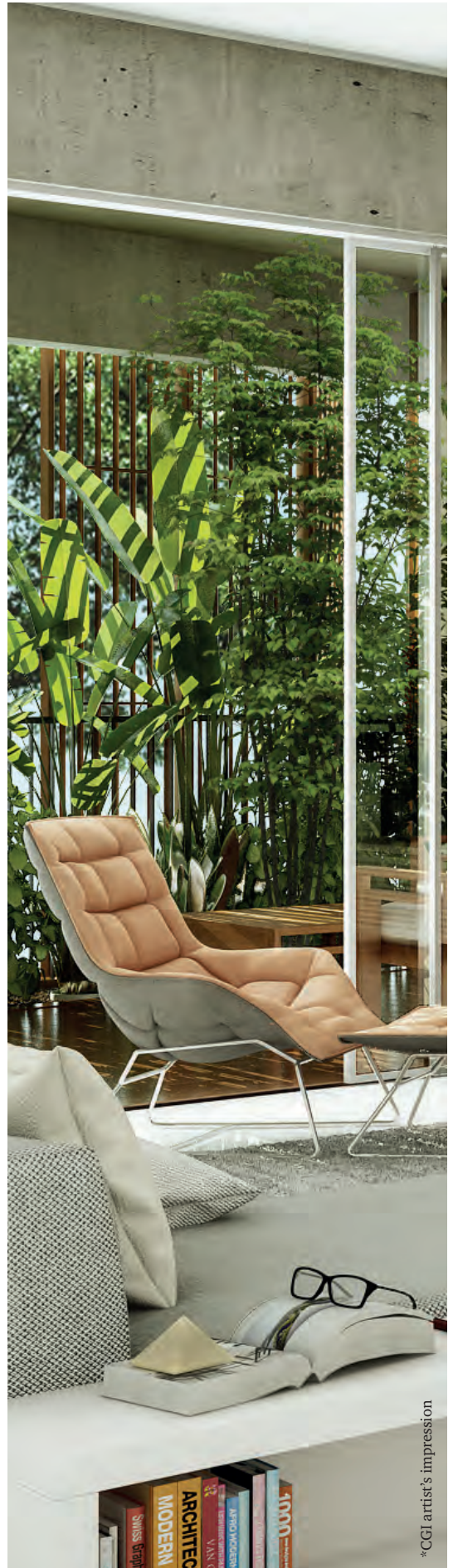
*CGI artist's impression