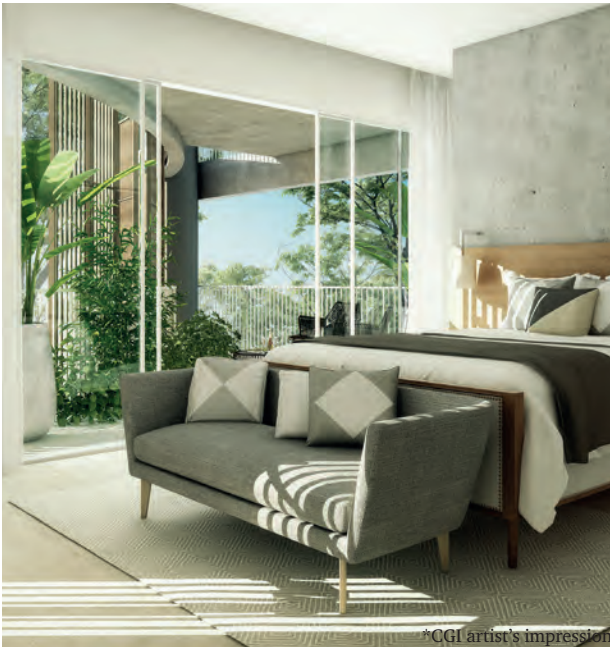
*CGI artist's impression