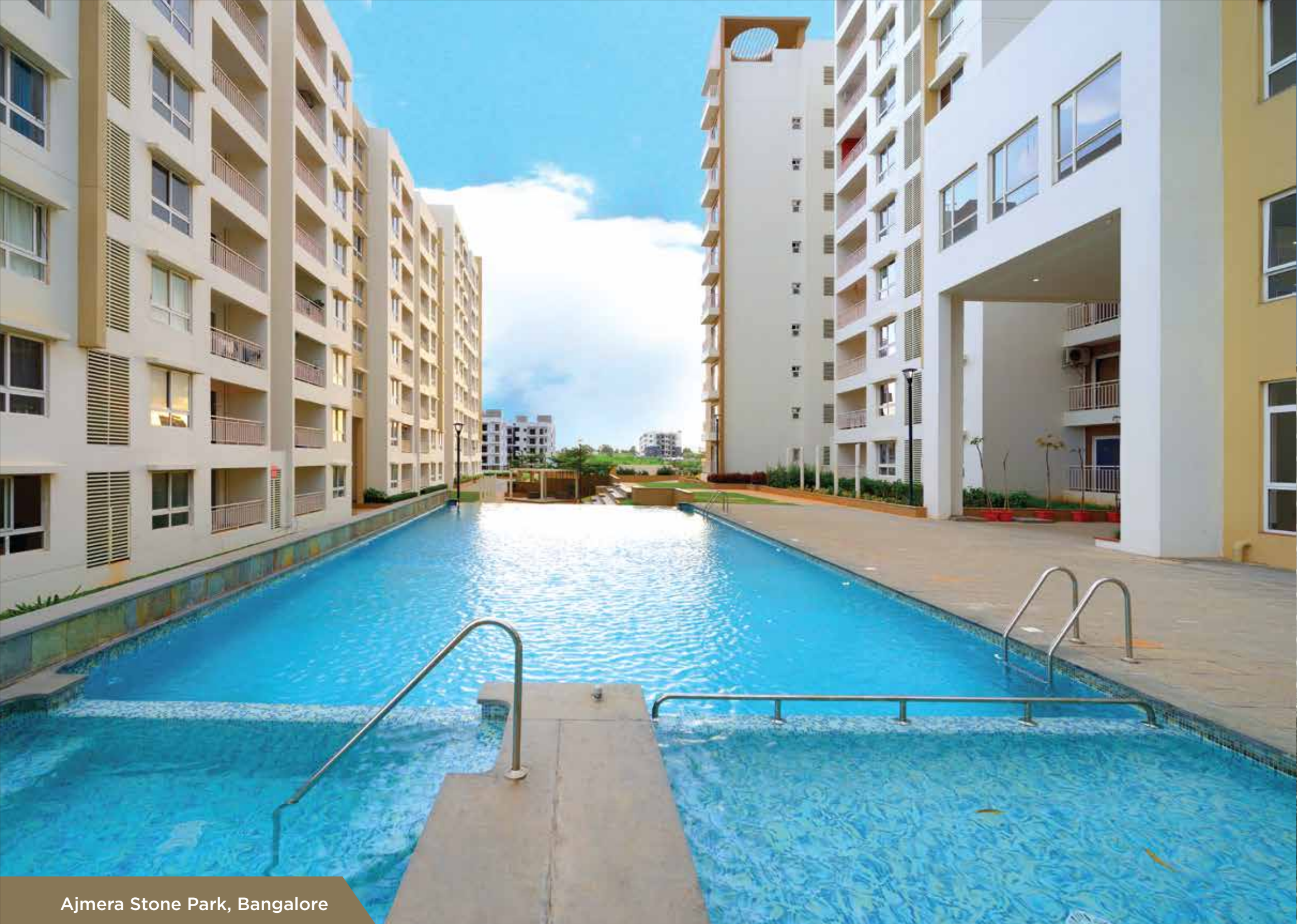
Ajmera Stone Park, Bangalore

Ajmera Stone Park is an ultimate living abode for those looking for living a king sized life replete with all the features and amenities that adds to a blissful living. The house will not dig a hole in the pocket of its owners and provide them with a stress-free life.