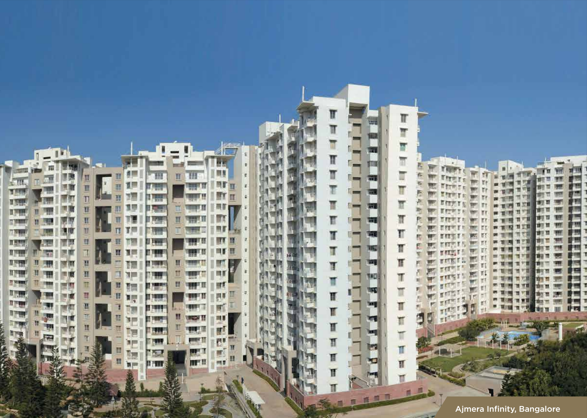
Ajmera Infinity, Bangalore

Ajmera Infinity Bangalore, premium 1, 2, 3 & 4 BHK apartments a total of 1268 units in all. Spreading over 18 acres of space. Well connected to places like Mico Layout, Bommanahalli, HSR Layout, Bilekahalli and Kammanhalli among others.