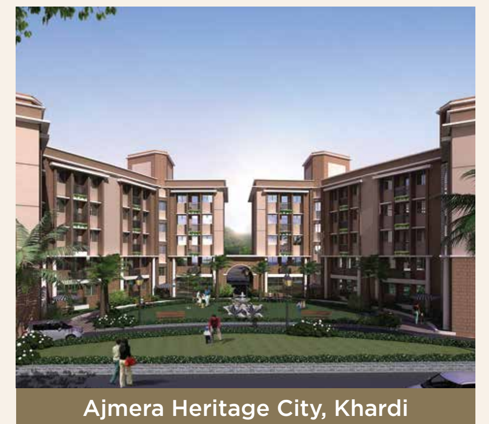
Ajmera Heritage City, Khardi