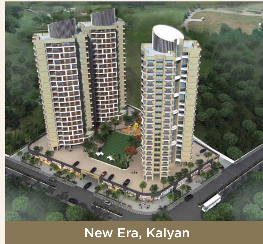
New Era, Kalyan