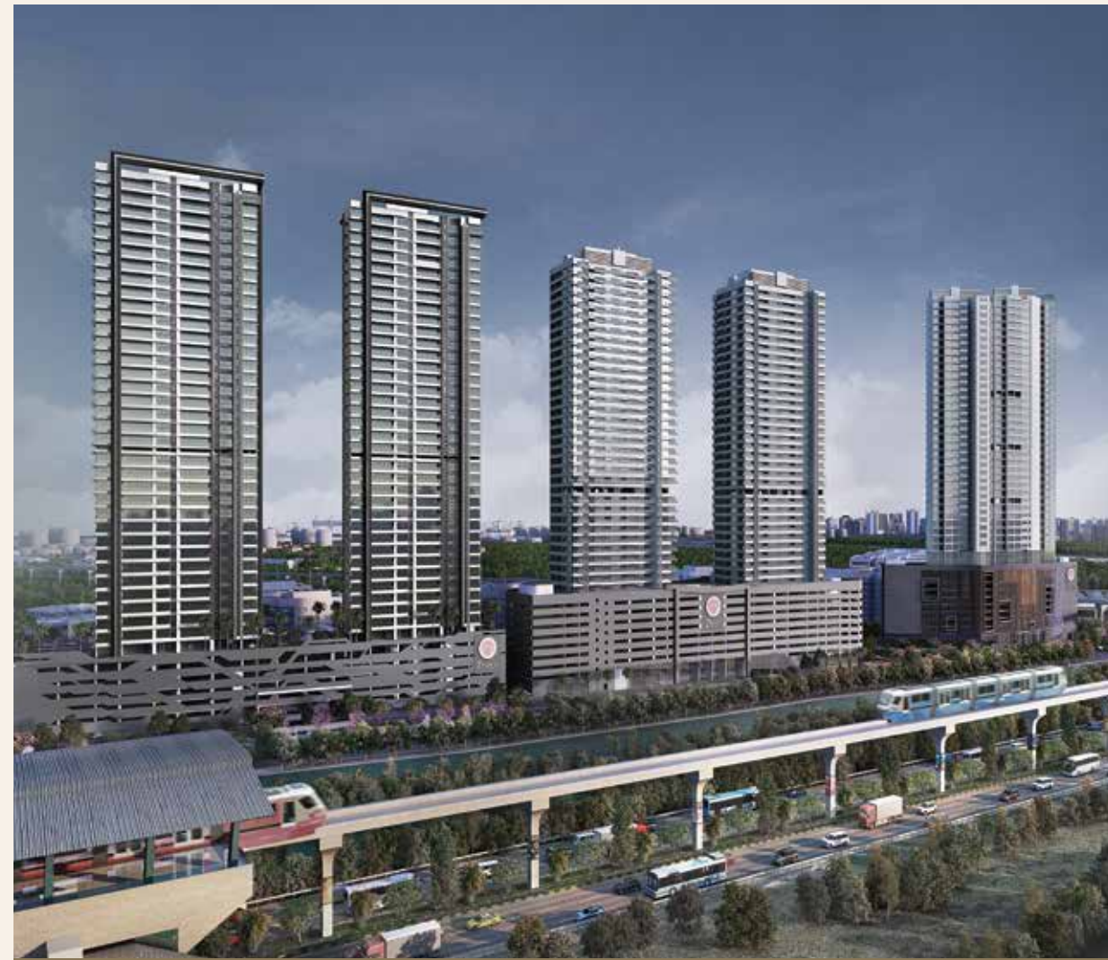
Ajmera i-Land, Mumbai

50 years of meticulously creating landmark one after another. Our presence of fifty years, finds us now in India's major cities, such as, Mumbai, Ahmedabad, Surat, Pune & Bangalore. Our ideology built on the constant factor of trust with both our customers and within our ranks has led us to this moment. Here are our previous projects.