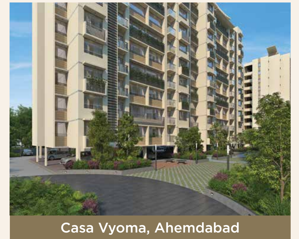
Casa Vyoma, Ahmedabad

Ajmera Aeon - MAHARERA REG NO. P51800000789 OC Received