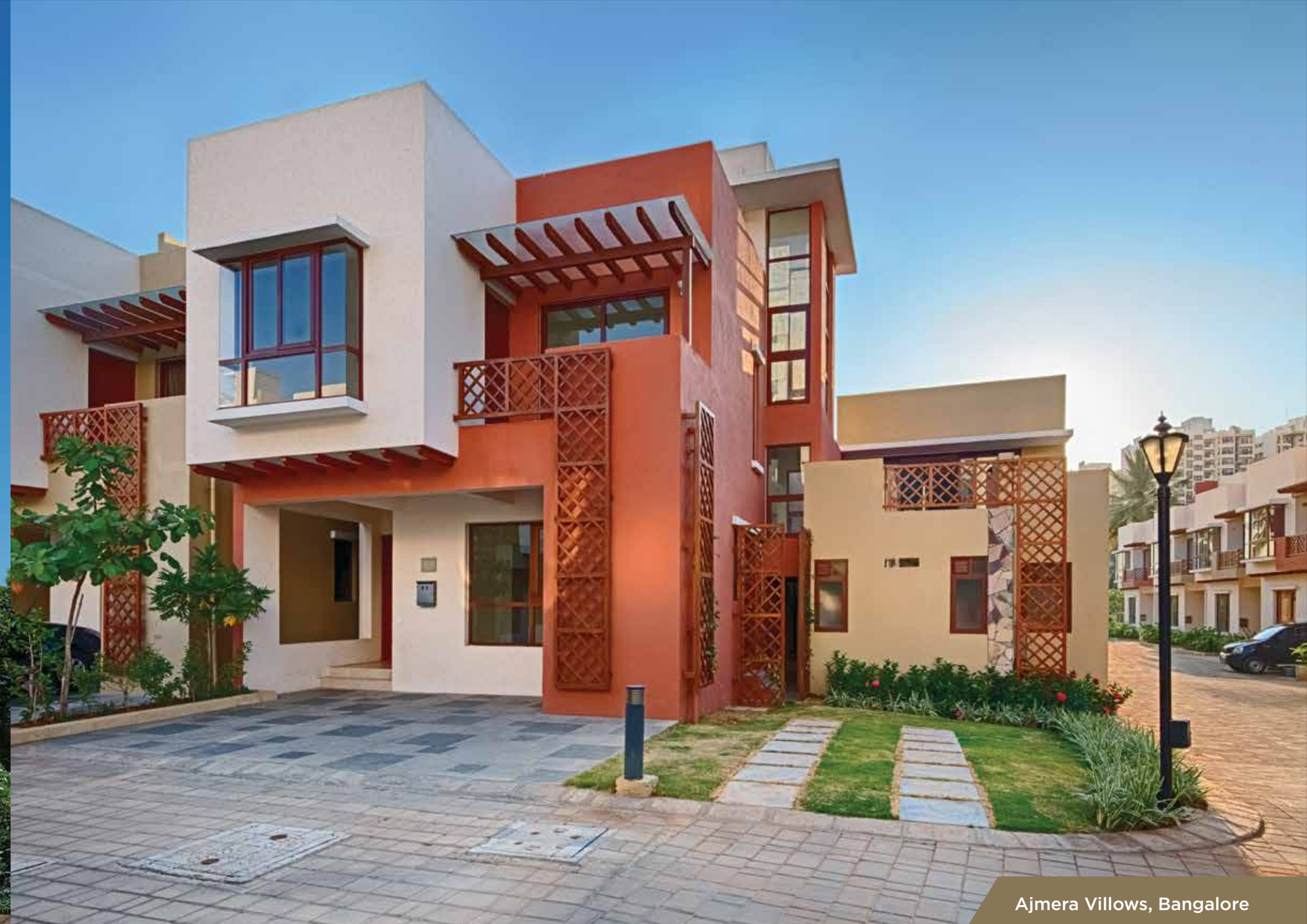
Ajmera Villows, Bangalore

Ajmera Annex Residential - PRM/KA/RERA/1251/310/PR/171014/000288 Ajmera Annex Commercial - PRM/KA/RERA/1251/310/PR/171014/000302