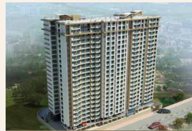
Ajmera Pristine, Mumbai