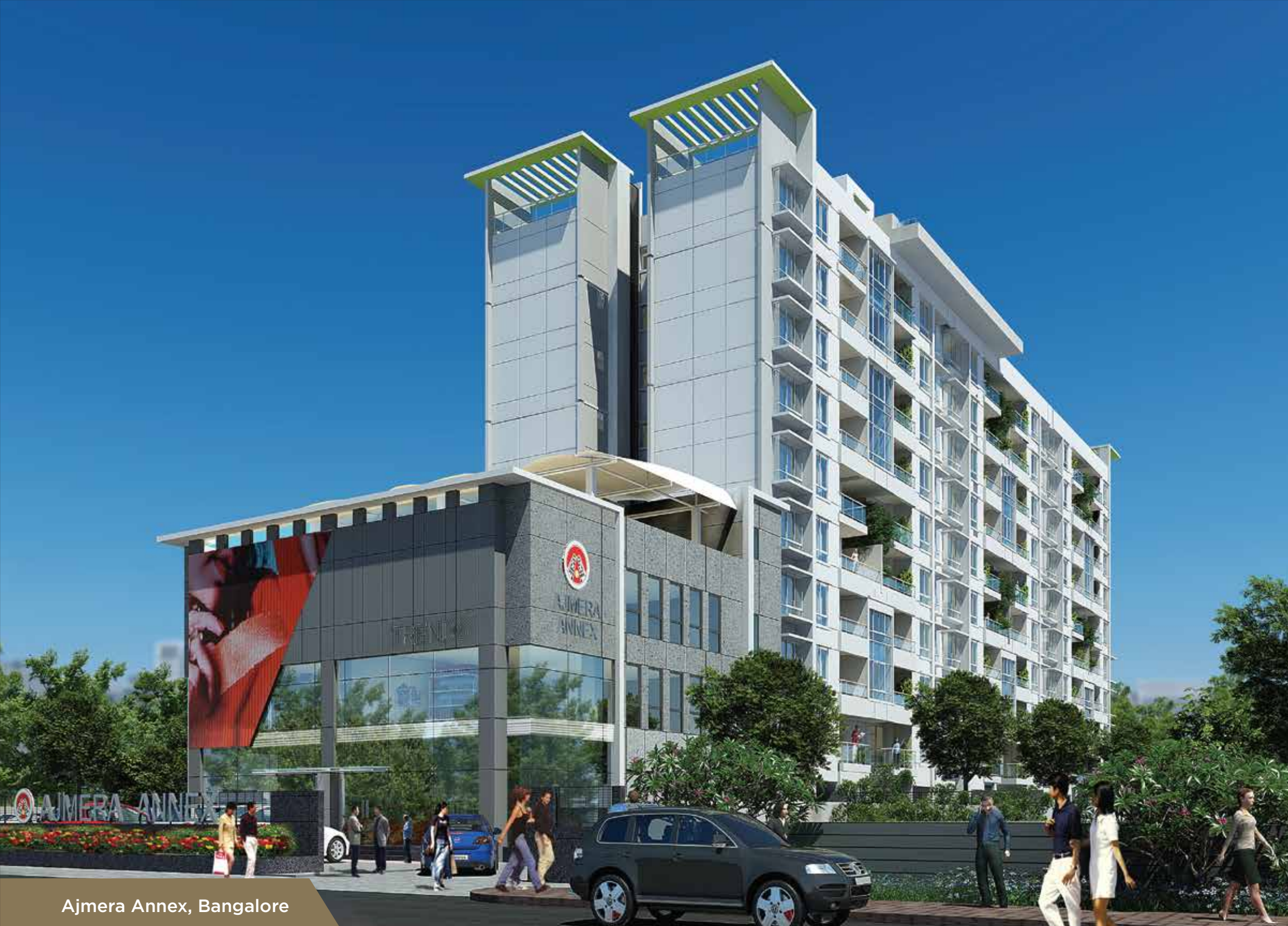
Ajmera Annex, Bangalore

Presenting smart spaces in the heart of Bangalore's growing IT hub, where compromise is a thing of the past. Smart spaces made just for you, brought to you sooner than you expected.