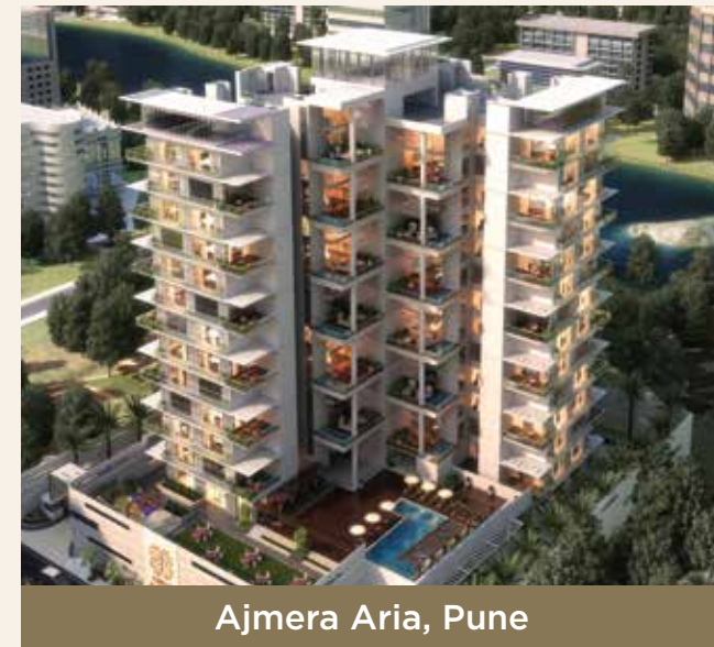
Ajmera Aria, Pune