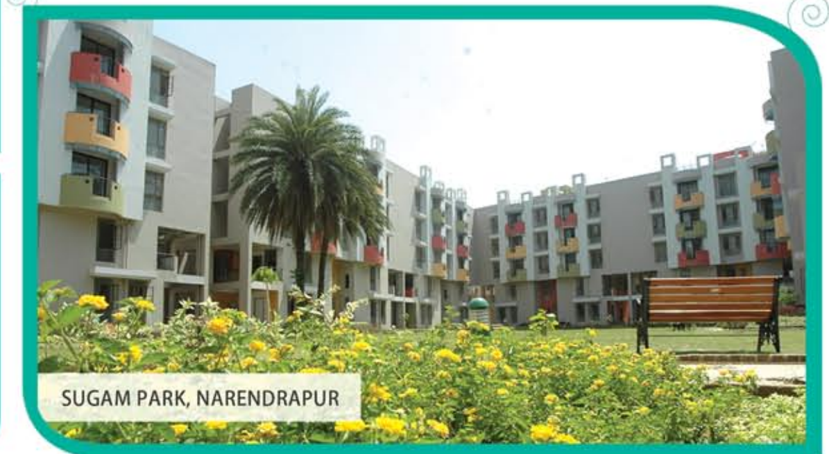
SUGAM PARK, NARENDRAPUR

Several large format housing, mini-townships and commercial developments are currently under conception and execution; including Sugam Park at Asansol a 30 acres Mini Township in public-private partnership with the Asansol Durgapur Development Authority (ADDA) and a 15 acres housing project in Konnagar, Kolkata .