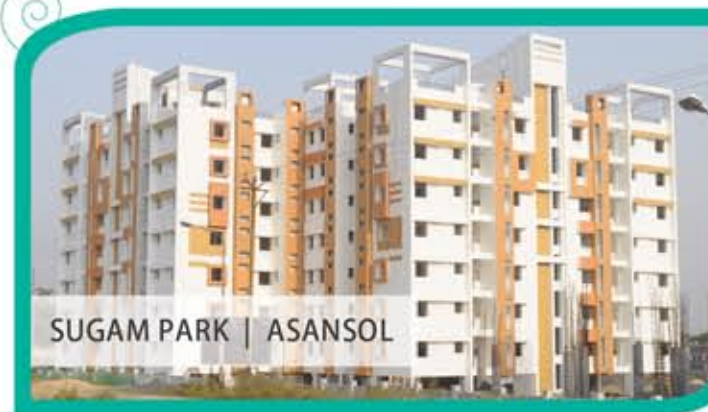
SUGAM PARK | ASANSOL