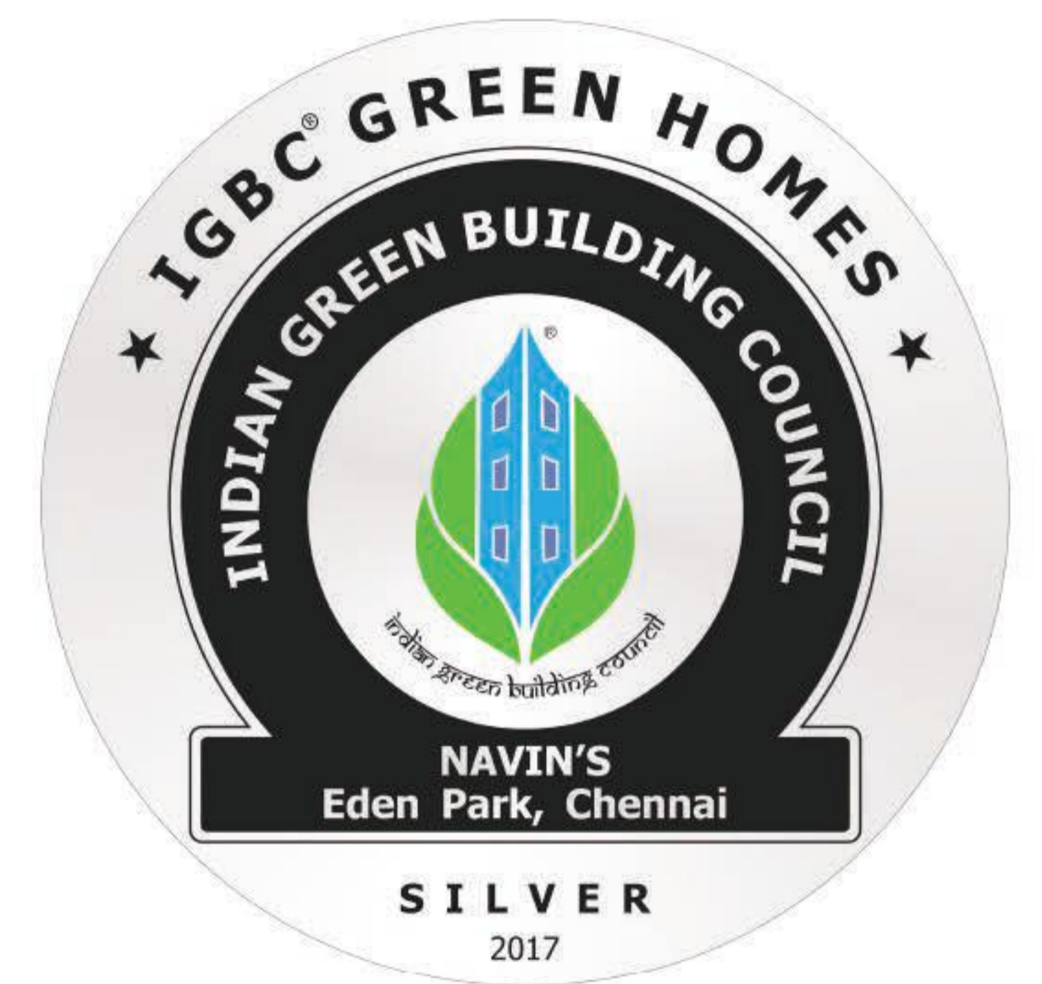
IGBC SILVER RATING