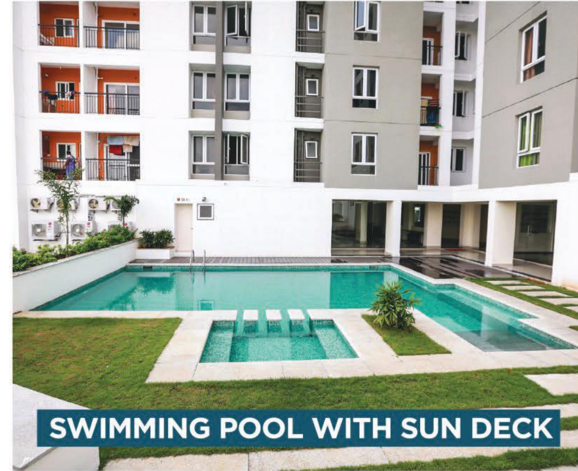
SWIMMING POOL WITH SUN DECK