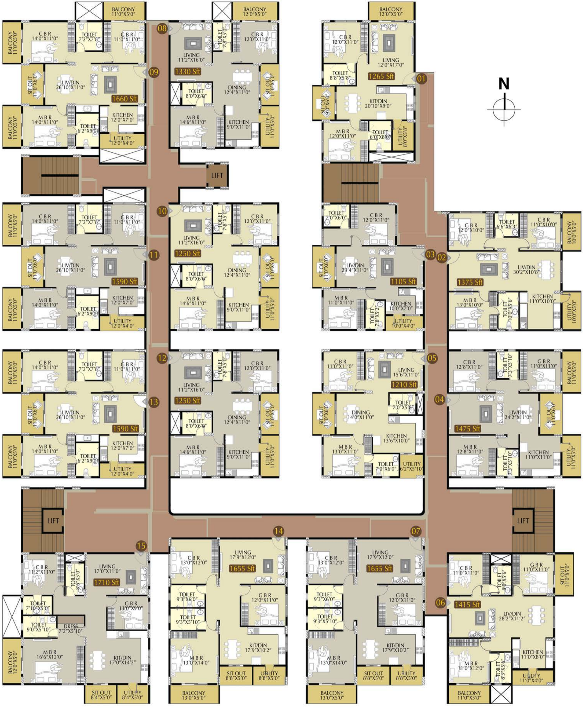
TYPICAL FLOOR PLAN - SECOND TO EIGHTH FLOOR