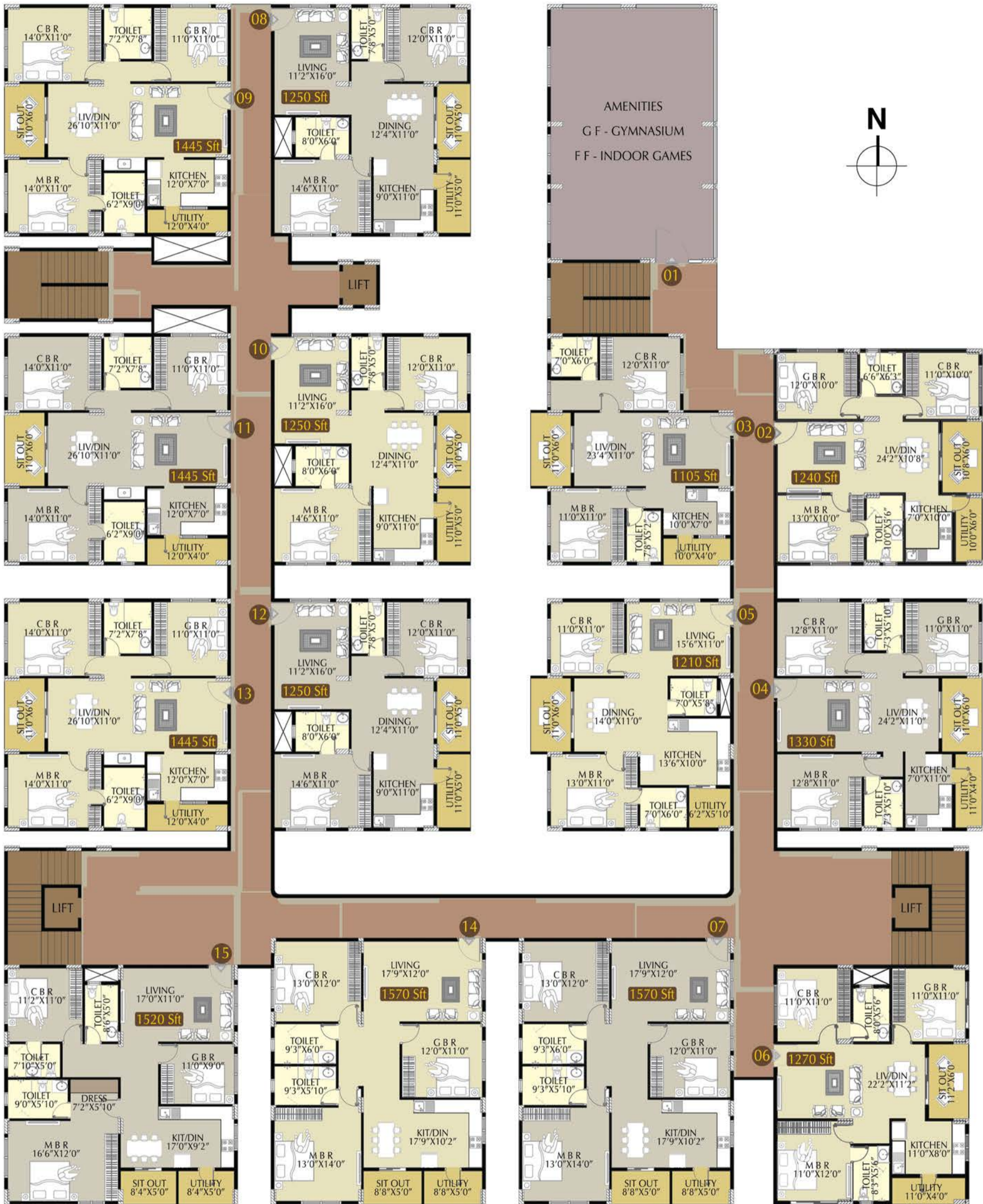
FLOOR PLAN - GROUND & FIRST FLOOR