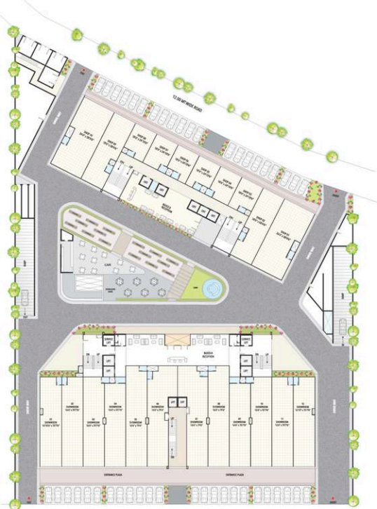
36.00 MI WIDE ROAD