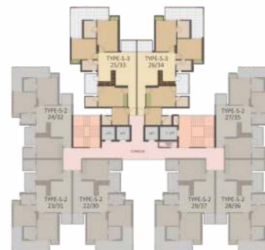
ORCHID TOWER / TULIP TOWER TYPE - S-3 UNIT- 25, 26, (TULIP TOWER) UNIT - 33, 34, (ORCHID TOWER)