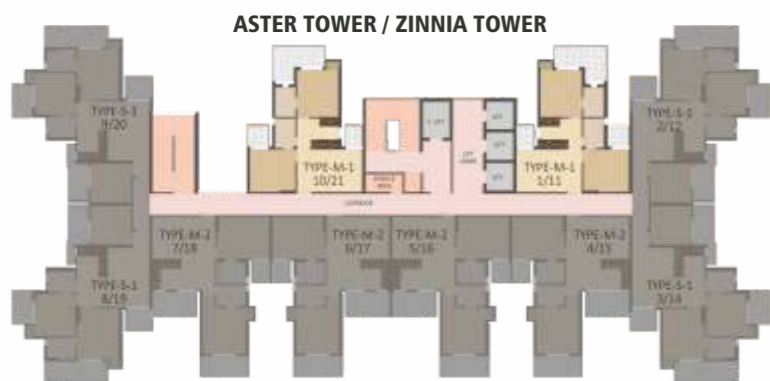
TYPE - M-1 UNIT 1,10 (ASTER TOWER) | UNIT 11,21 (ZINNIA TOWER)