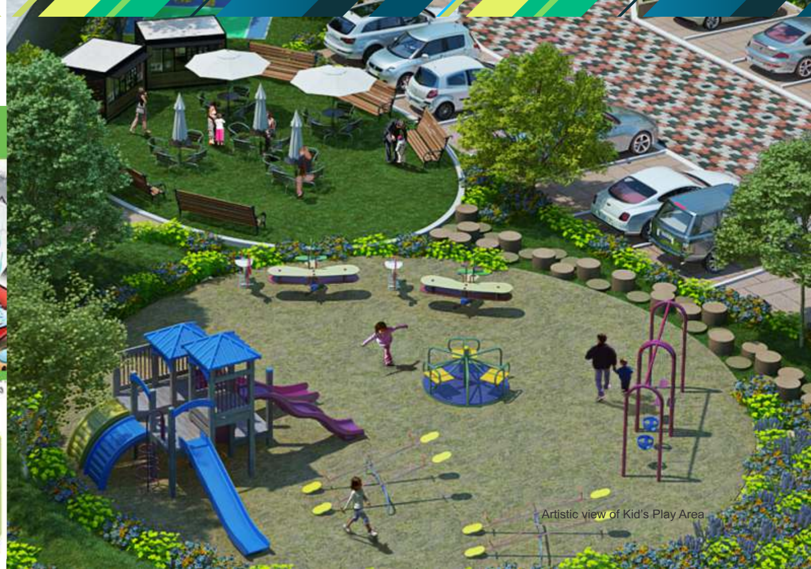
Artistic view of Kid's Play Area