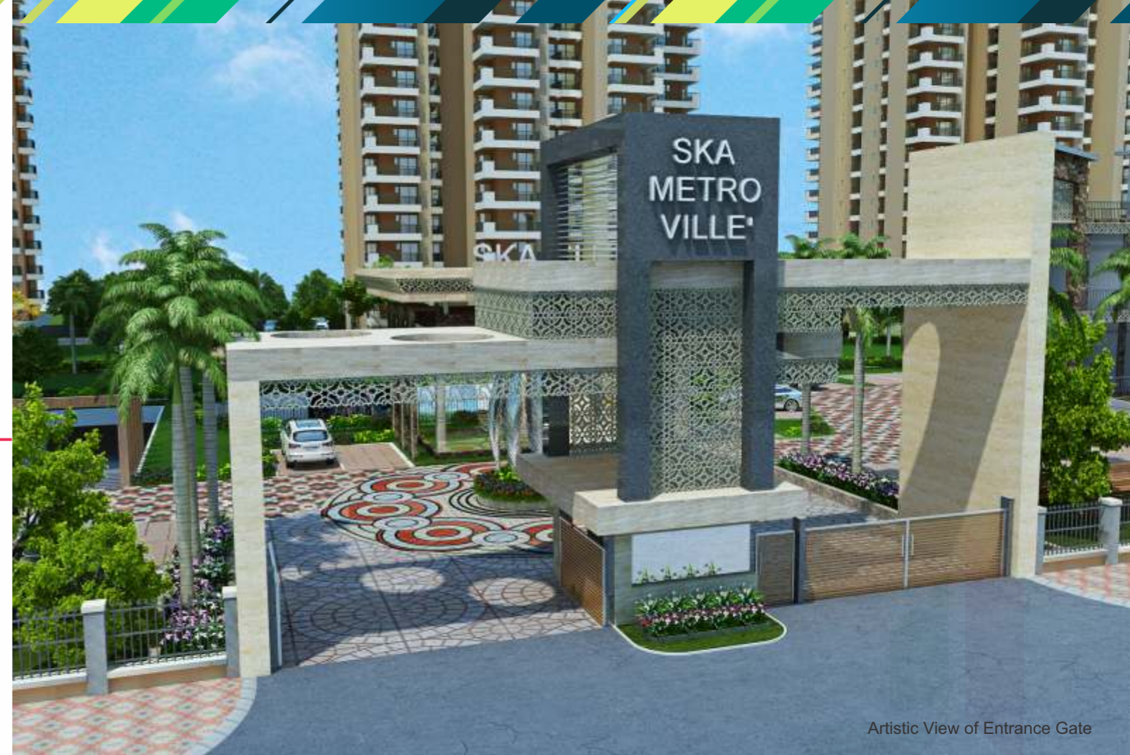
Artistic View of Entrance Gate