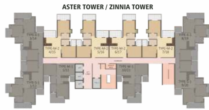
TYPE - M-2 UNIT - 4, 5, 6, 7 (ASTER TOWER) | UNIT - 15, 16, 17, 18 (ZINNIA TOWER)