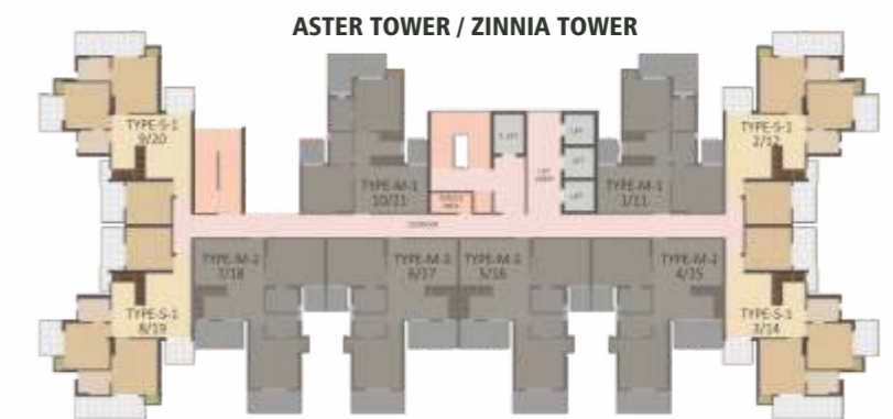
TYPE - S-1 UNIT - 2, 3, 8, 9 (ASTER TOWER) | UNIT - 12, 14, 19, 20 (ZINNIA TOWER)