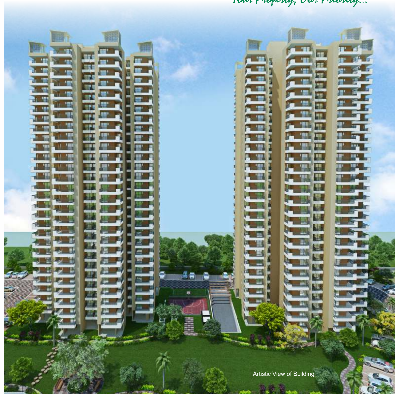
Artistic View of Building