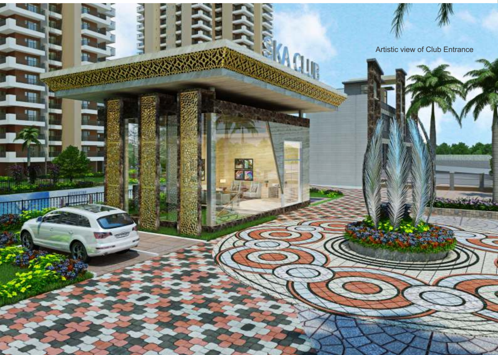
Artistic view of Club Entrance