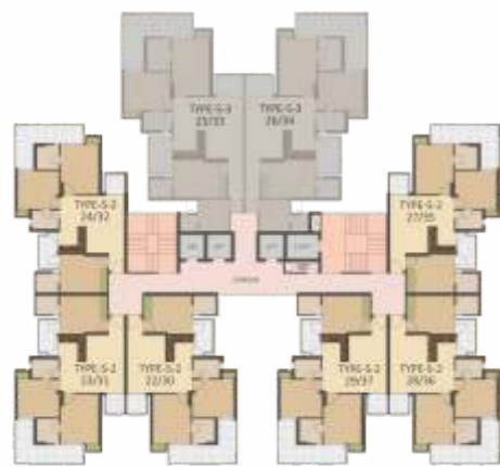
ORCHID TOWER / TULIP TOWER TYPE - S-2 UNIT- 22, 23, 24, 27, 28, 29 (TULIP TOWER) UNIT - 30, 31, 32, 35, 36, 37 (ORCHID TOWER)