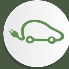
Charging point for electric vehicles