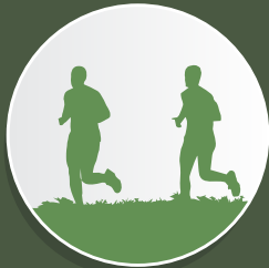
Walking / Jogging trail