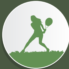
Tennis & Squash courts