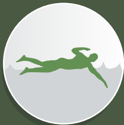
Vanishing edge pool