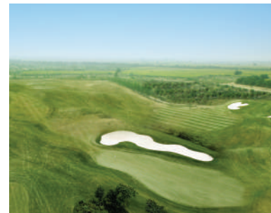
18 Hole Golf Course