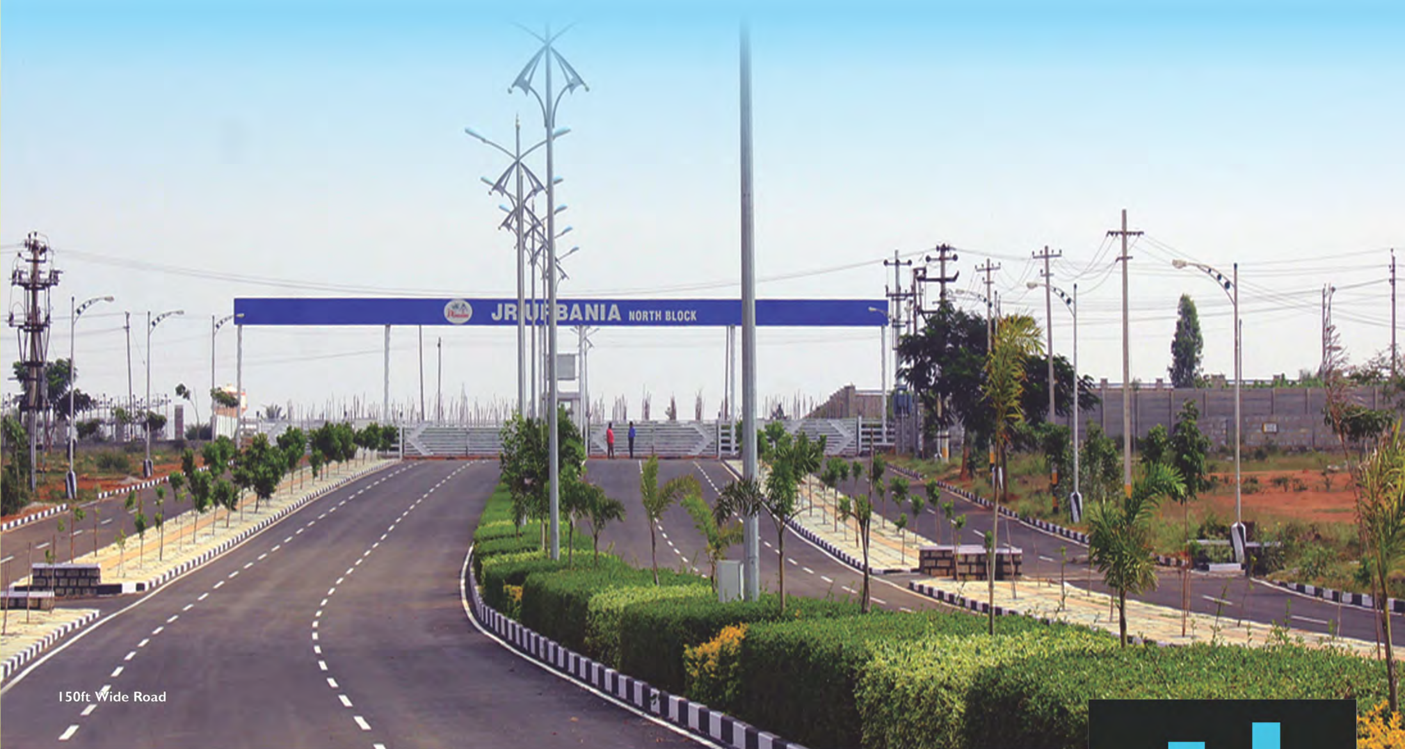
150ft Wide Road

Urbania, a Latin-American name meaning born of the city, is given by proud rural parents to their daughters who have the privilege of being born in the city, and thus enjoying a superior quality of life and unlimited opportunity for self realization.