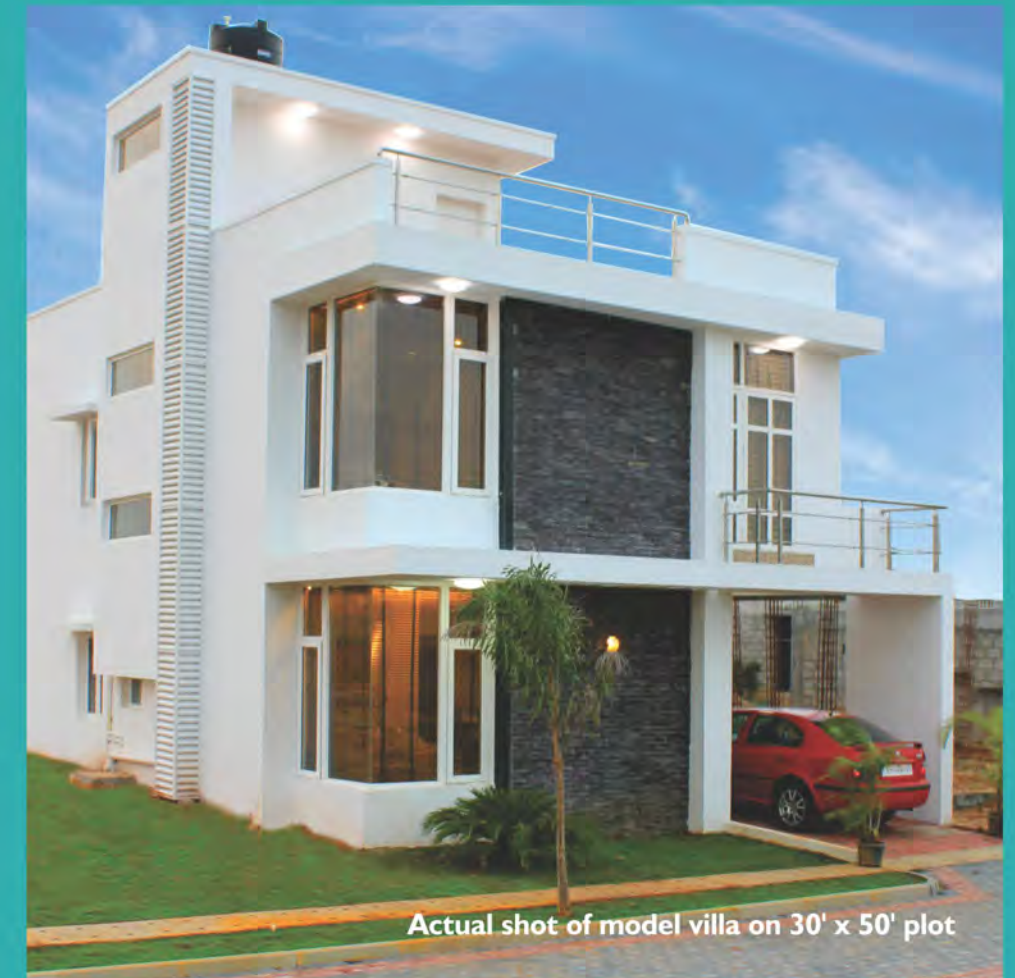
Actual shot of model villa on 30' x 50' plot