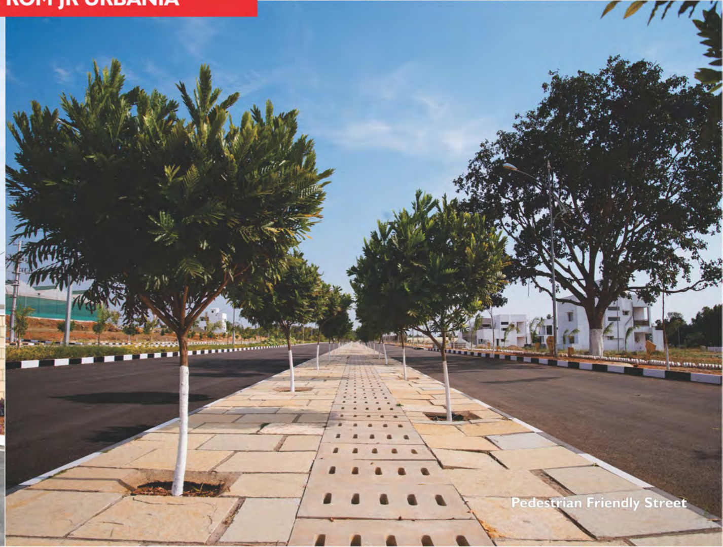
Pedestrian Friendly Street