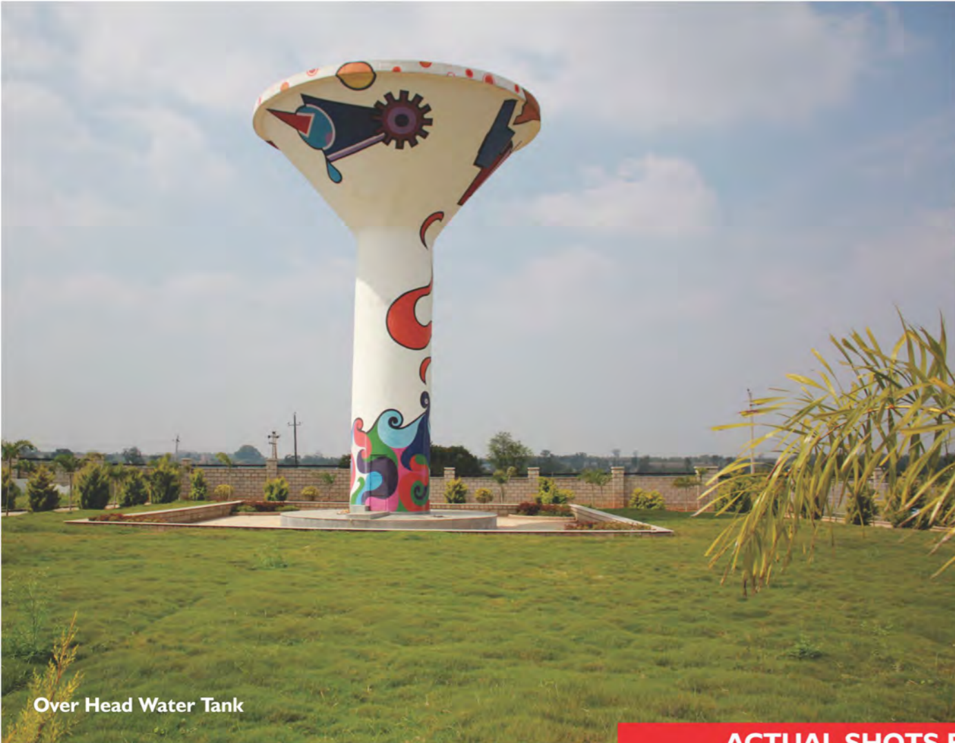
Over Head Water Tank