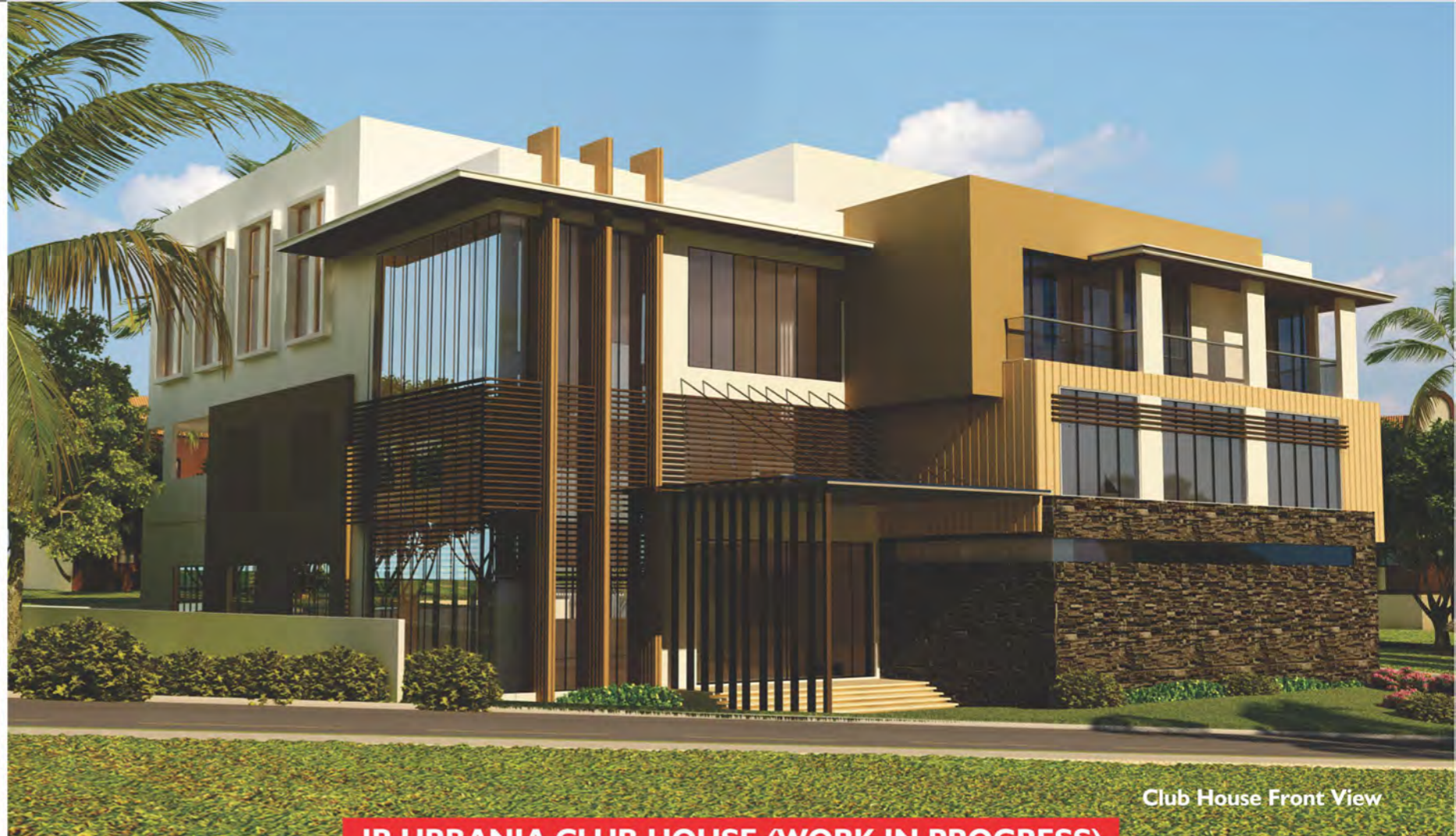
Club House Front View

Underground drainage lines with 500 KLD operational Sewage Treatment Plant