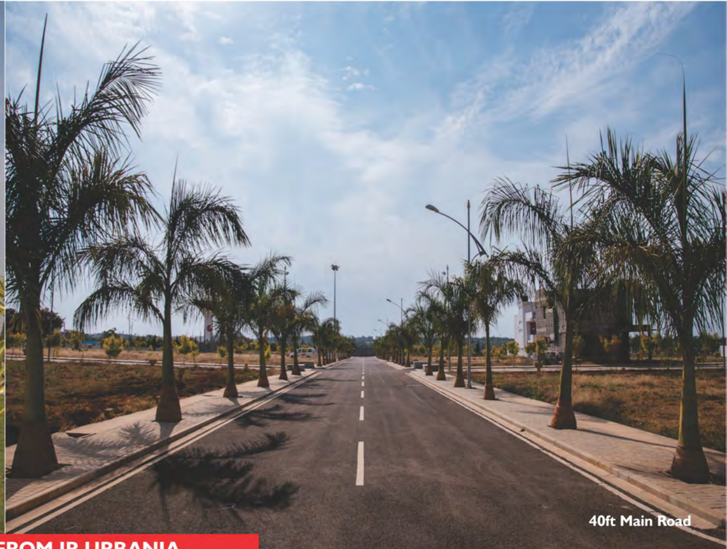
40ft Main Road