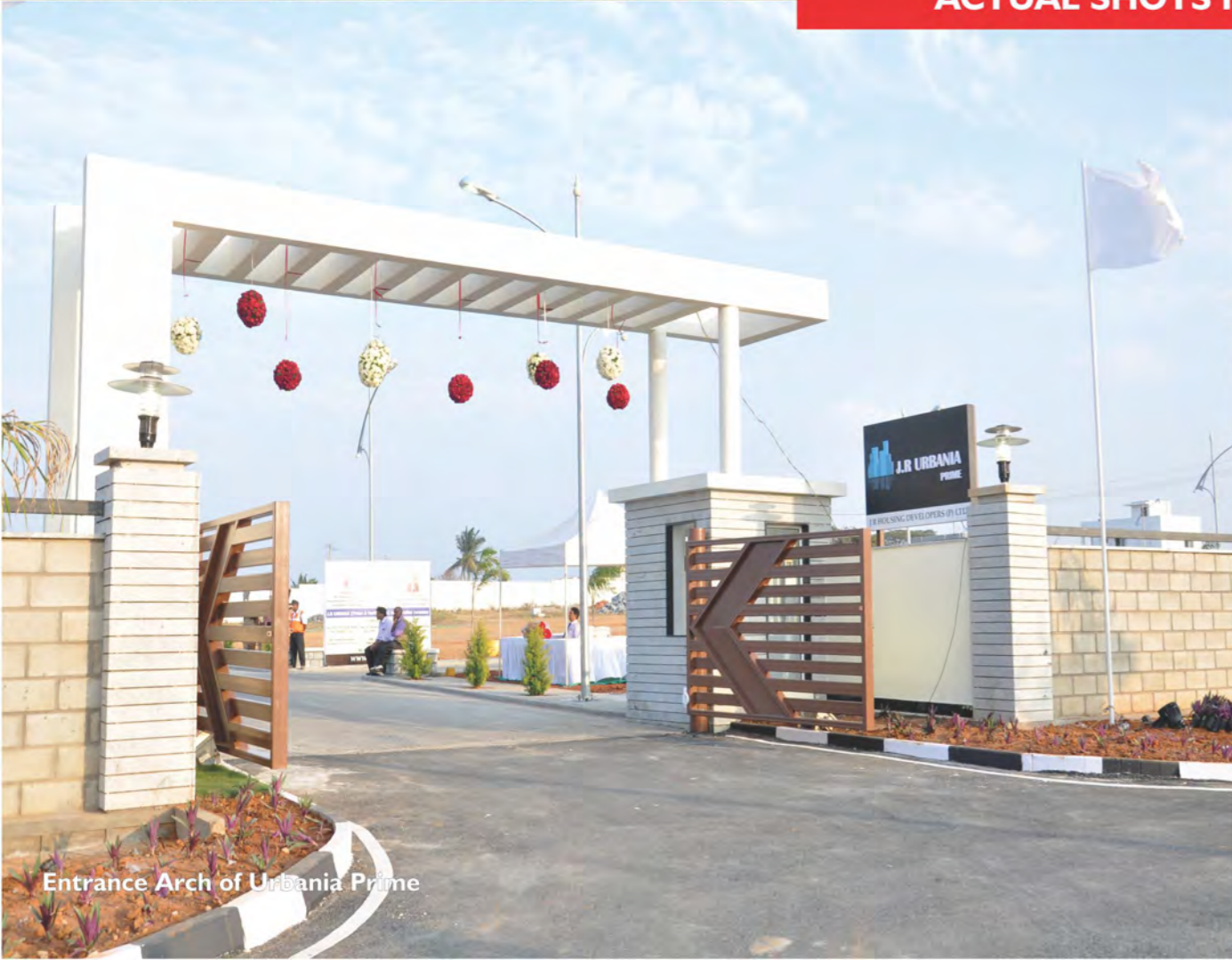
Entrance Arch of Urbania Prime