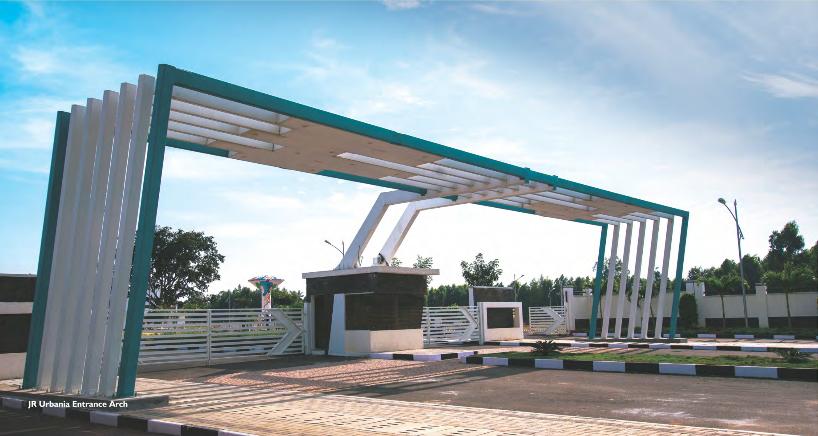
JR Urbania Entrance Arch