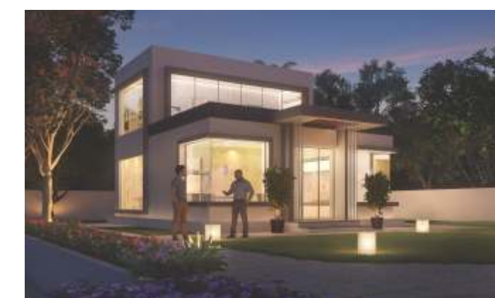
MULTIPURPOSE COMMUNITY HALL