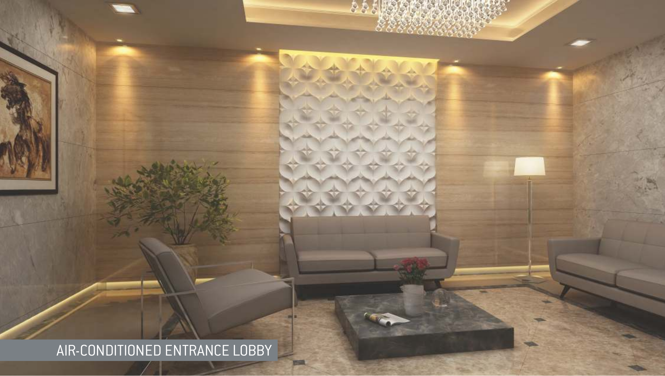
AIR-CONDITIONED ENTRANCE LOBBY