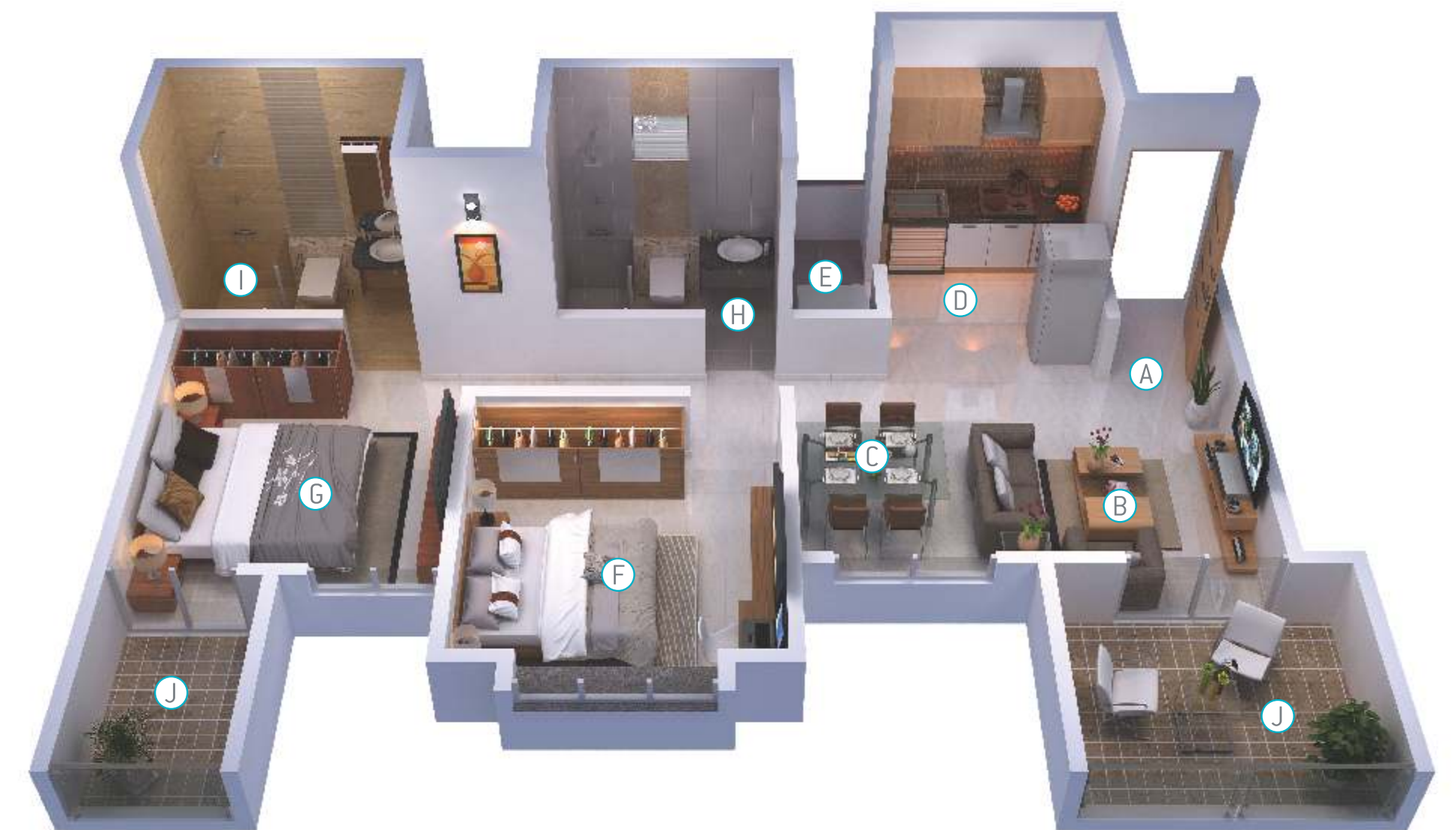
BUILDING - 2 BHK TYPE 'B' AREA - 1020 Sqft.