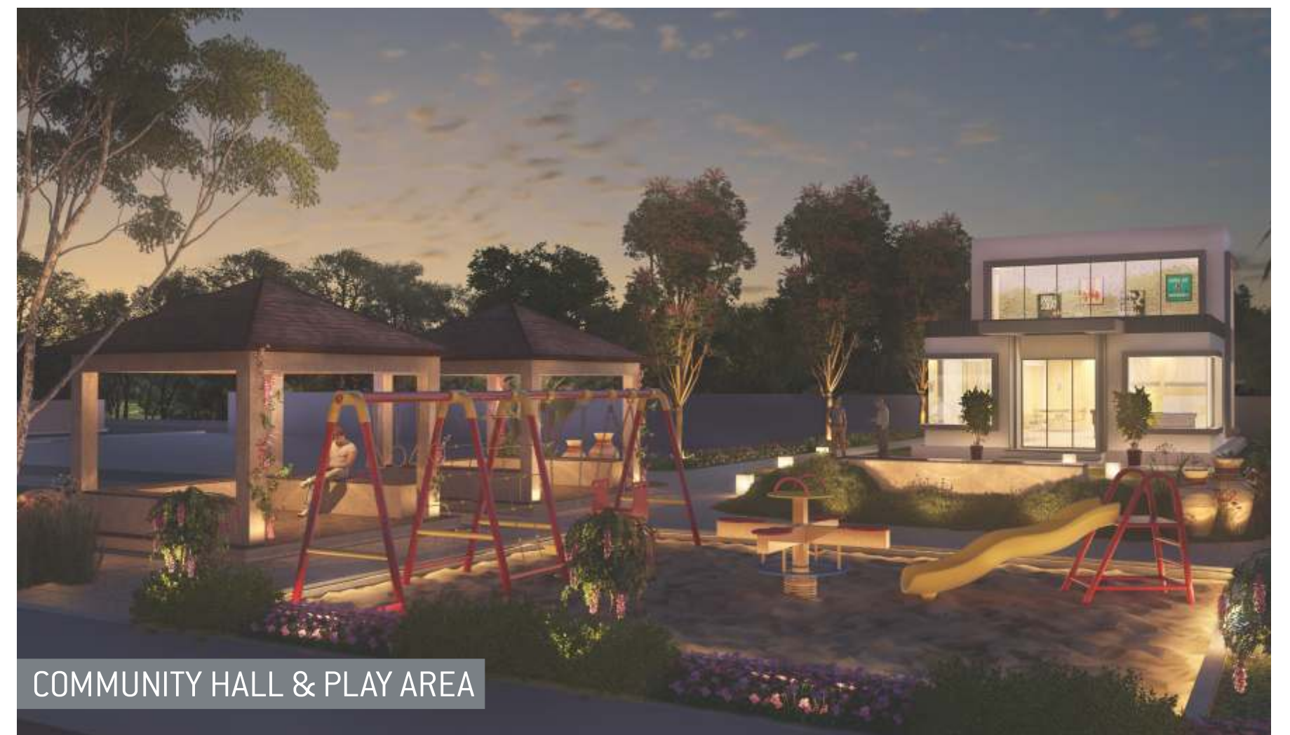
COMMUNITY HALL & PLAY AREA