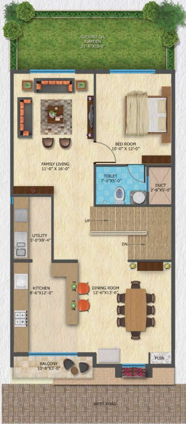
First Level Plan