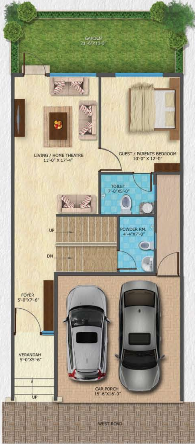
Optional Ground Level Plan