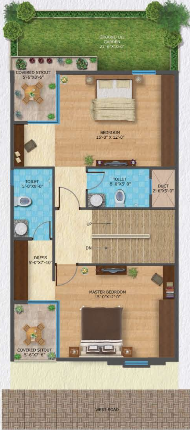
Second Level Plan

Area Statement Total Built-up Area-2690 sqft 2 Car Parks Number of Bedrooms-4 Number of Bathrooms-5 Private Terrace-610 sqft Backyard Garden-220 sqft