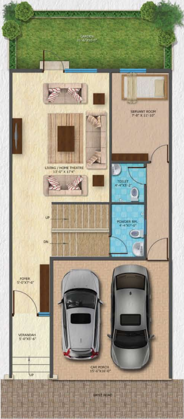
Ground Level Plan