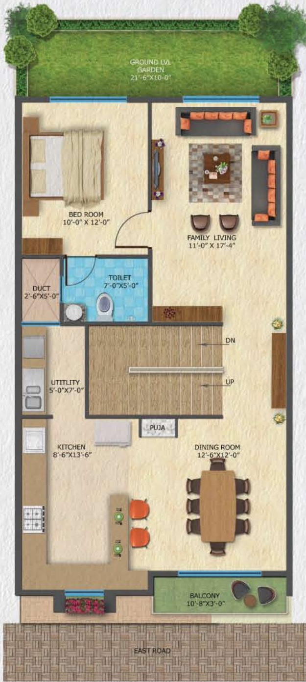
First Level Plan