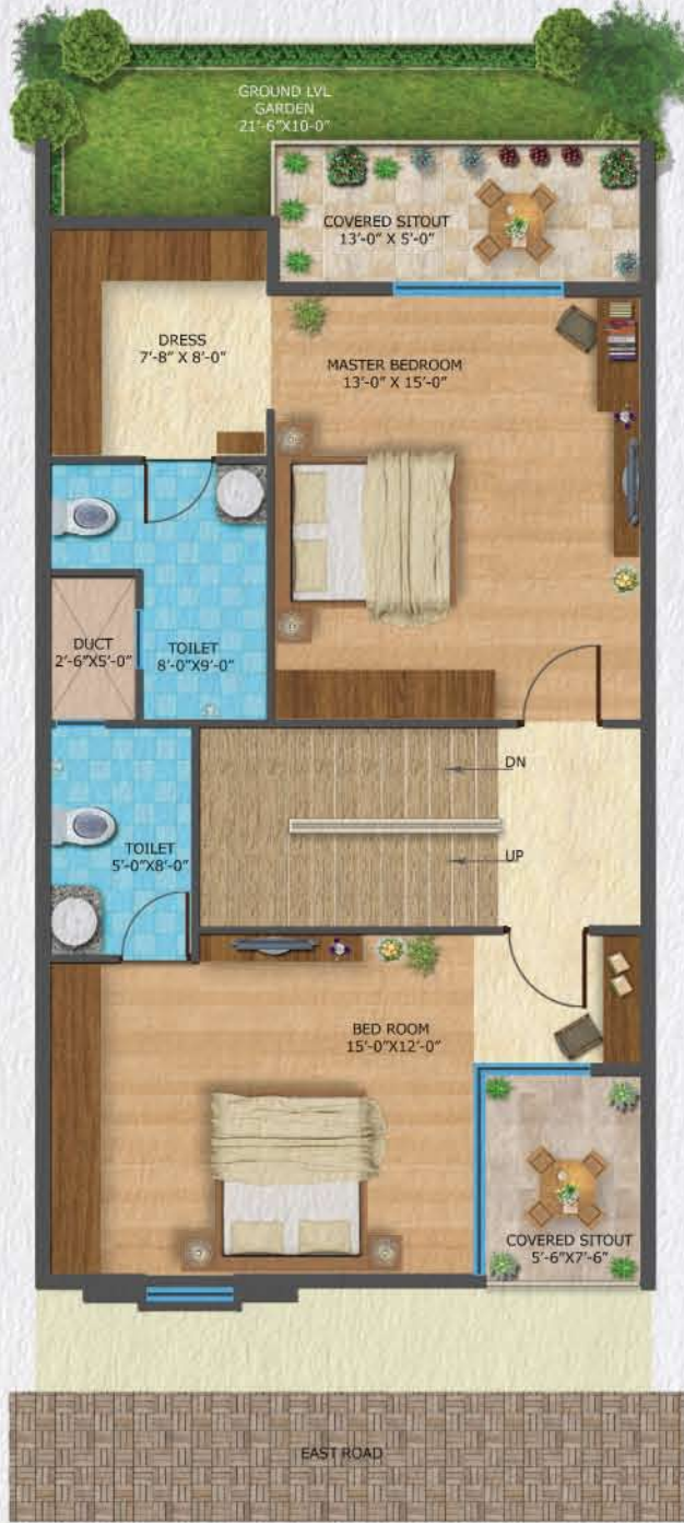
Second Level Plan

Area Statement Total Built-up Area- 2642 sqft 2 Car Parks Number of Bedrooms- 4 Number of Bathrooms- 5 Private Terrace- 610 sqft Backyard Garden- 220 sqft