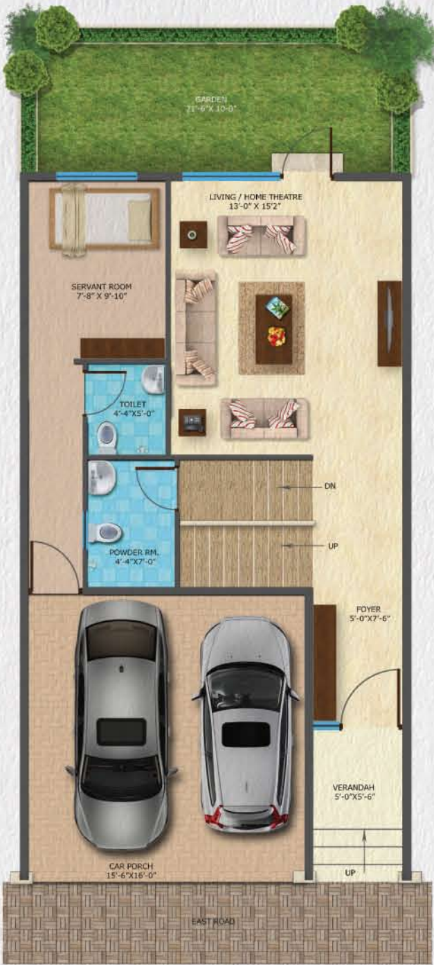
Ground Level Plan