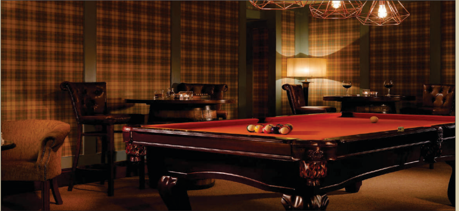
Billiards Room View

CLUB HOUSE : Spread across 4500*sq.ft a modern club house make sure you have all the ingredients to relax and stay fir. An outdoor swimming pool , party hall , 24 hours coffee shop/ATM , Essential shop , well equipped gym , Billiards, Table tennis , caroms & chess rooms , pool table and conference room will make sure you will never want to step out.