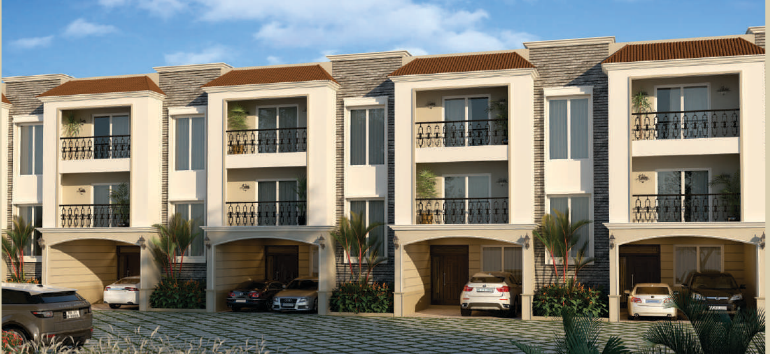
Spandana Row Villas Elevation

Daiwik Spandana is a gated community spread across 2.25 acres of well planned modern living with only 61 villas/ bungalows. Daiwik spandana is an ideal home suited for your contemporary lifestyle. Every space is built keeping today's needs in mind for you to live a comfortable and easy life.