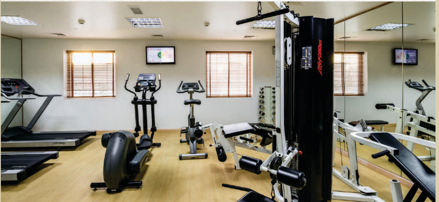
Gym Interior View