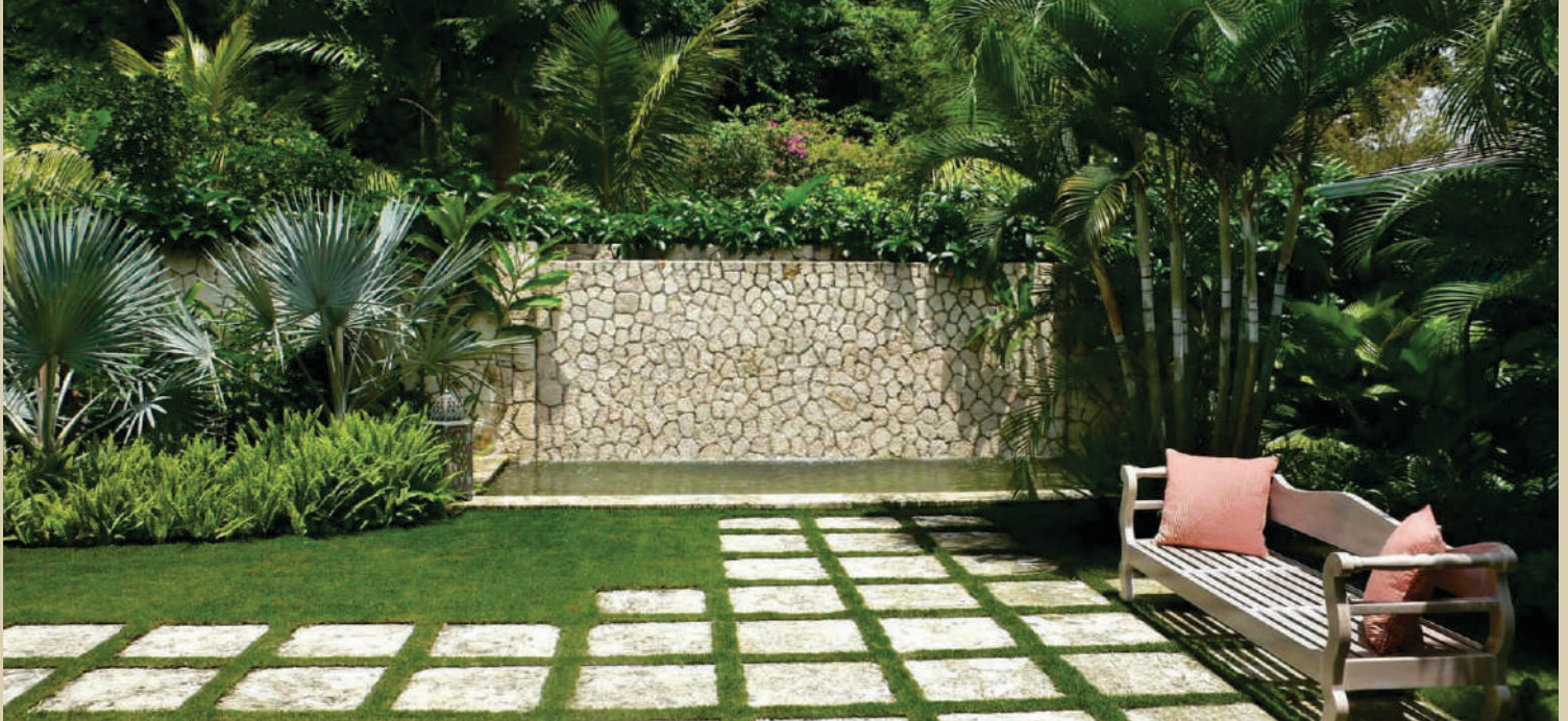
Villa Backyard Lawn View

AT DAIWIK SPANDANA : Each villa/bungalow has a green zone where you can rejoice your quite ponderings. The backyard private/personal garden help you to host guests and also allows you muture you secrete garden . The villas/bungalows are designed to make sure you have enough of light and ventilation to keep yourself charged and fresh.