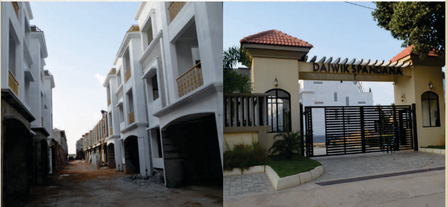
Contructions in full Swing