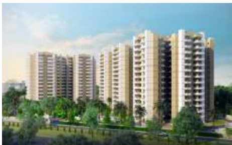
M.I. Citi Homes, Greater Noida