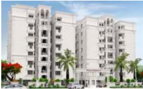
Riviera Residency Phase II, Lucknow

M.I. Group has heralded into an era of new technologies, bold designs, and higher standards of living. Ever since its incorporation in 1987, M.I. Group has over 28 years of track record or progressive growth and customer satisfaction. Contribute to building an era that transcends time.