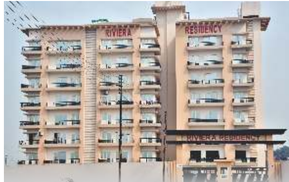
Riviera Residency, Gomti Nagar Extn., Lucknow