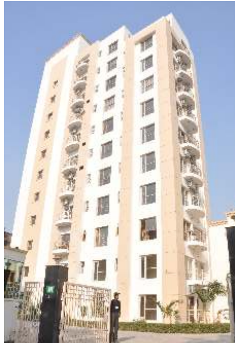
Golf Gardenia, Greater Noida