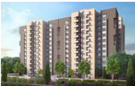
M.I. Legacy, Greater Noida