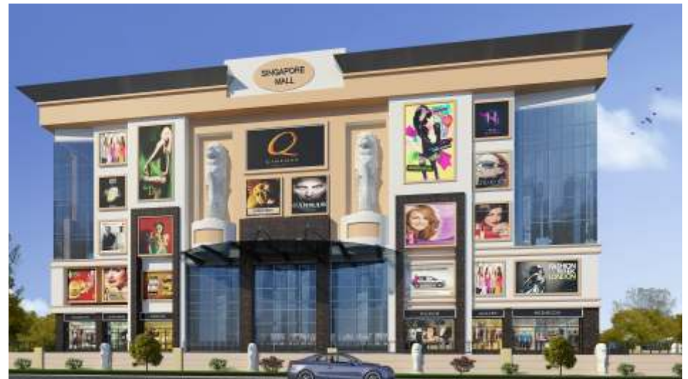
Singapore Mall, Viraj Khand, Gomti Nagar, Lucknow