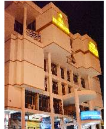
M.I. New Janpath Complex Hazratganj, Lucknow