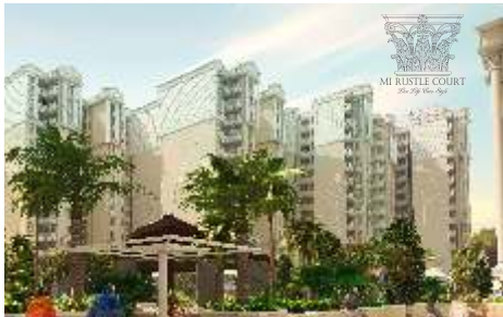
M.I. Rustle Court, Gomti Nagar, Lucknow