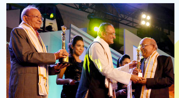
Hon'ble Finance Minister Dr Amit Mitra, GoWB handing over Life time Achievement Awards to Emami Joint Chairmen at the Economic Times Bengal Corporate Awards 2016