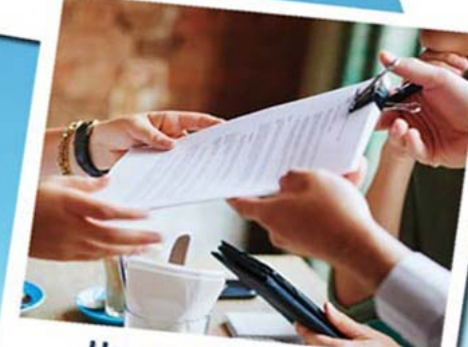
Uncompromising Commitments to Customers