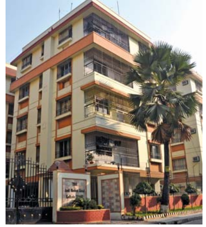
Mandeville Garden Court Phase I & II Ballygunge