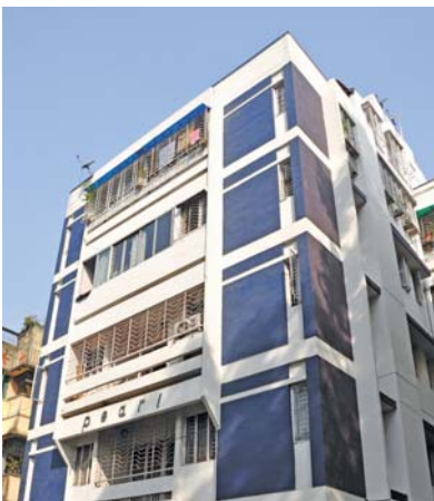
Pearl Apartments Jodhpur Park