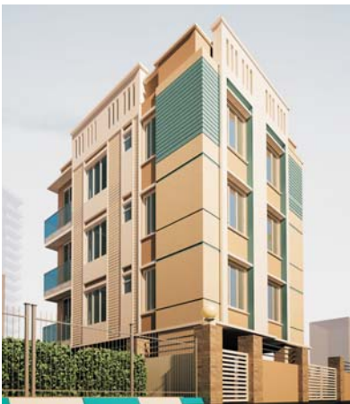
Mandeville Garden Court Annexe Ballygunge