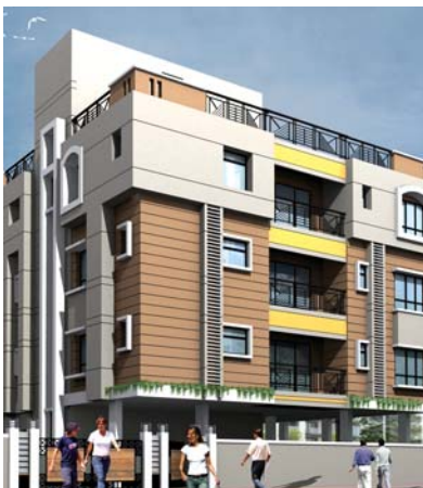
Abhinaash Petunia Laskarhat