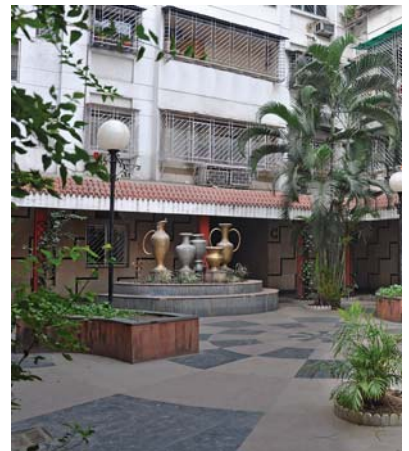
Windsor Palace Ballygunge