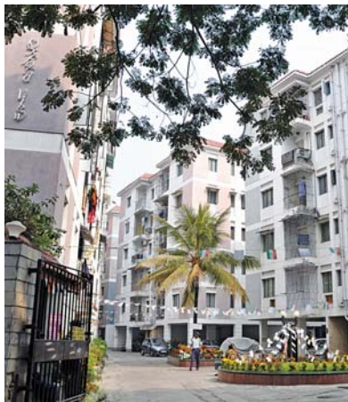
Oxford View Behala