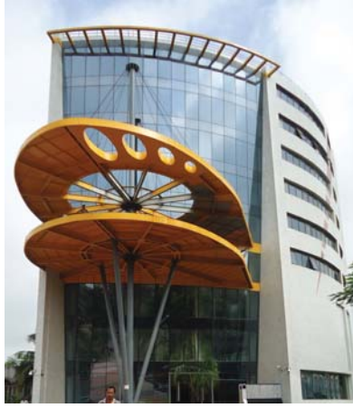
AMP Vaishaakhi Salt Lake Sector II