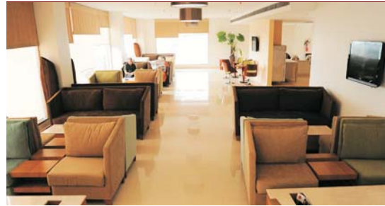
Waiting Lounge at the Ground Floor