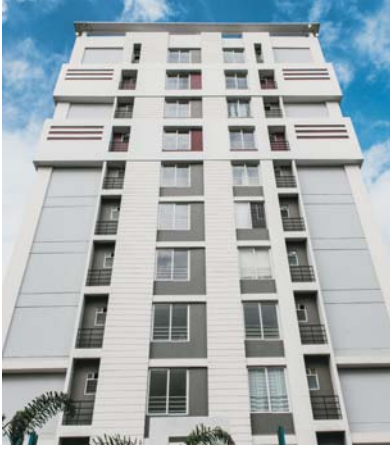
Mandeville Garden Court Phase III Ballygunge