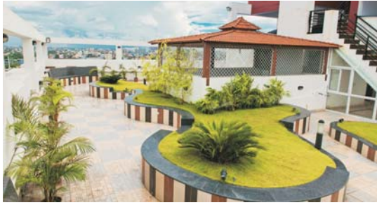
Roof Top Garden