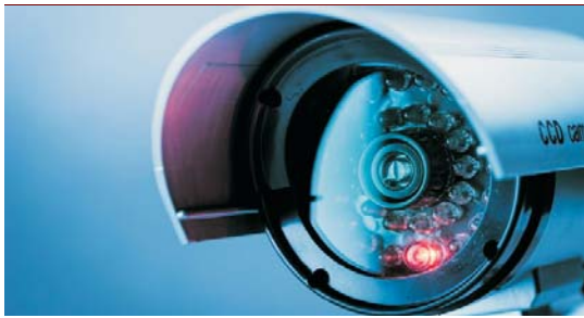
Two Tier Security System with CCTV