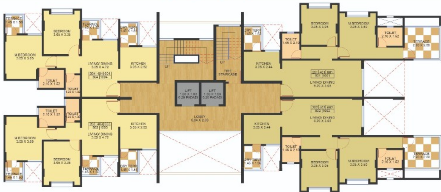
CARPET AREA STATEMENT AS PER MAHA R.E.R.A. ACT