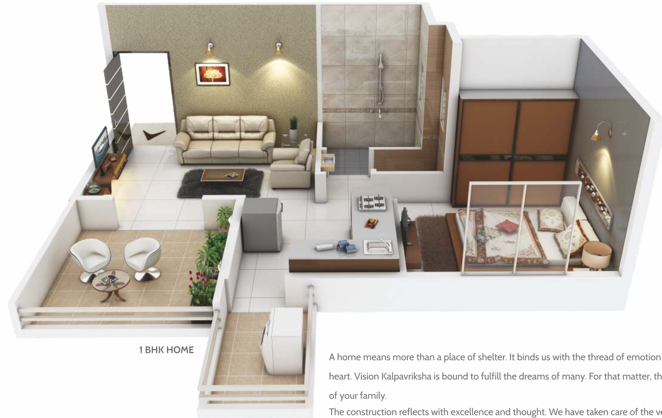
1 BHK HOME

Dreams are realized only when you dream them!