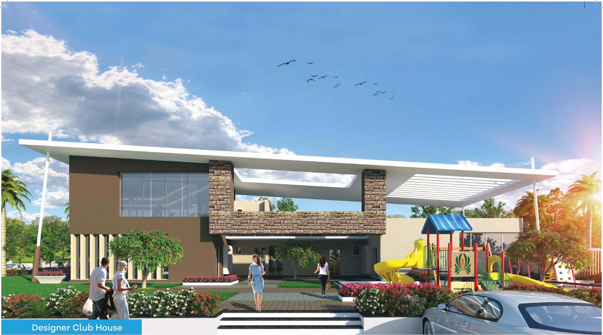
Designer Club House