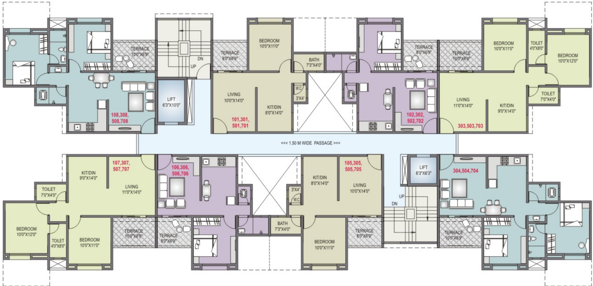
Area Statement in sq.ft.