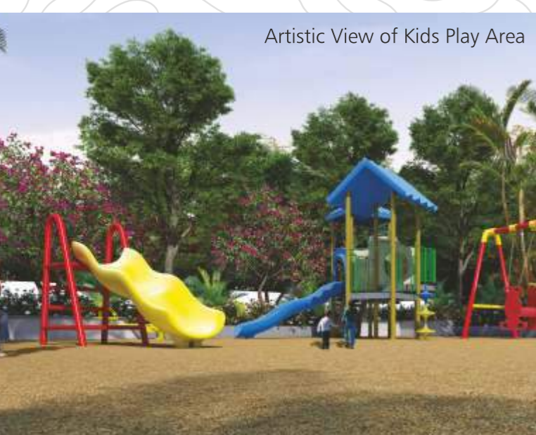
Artistic View of Kids Play Area