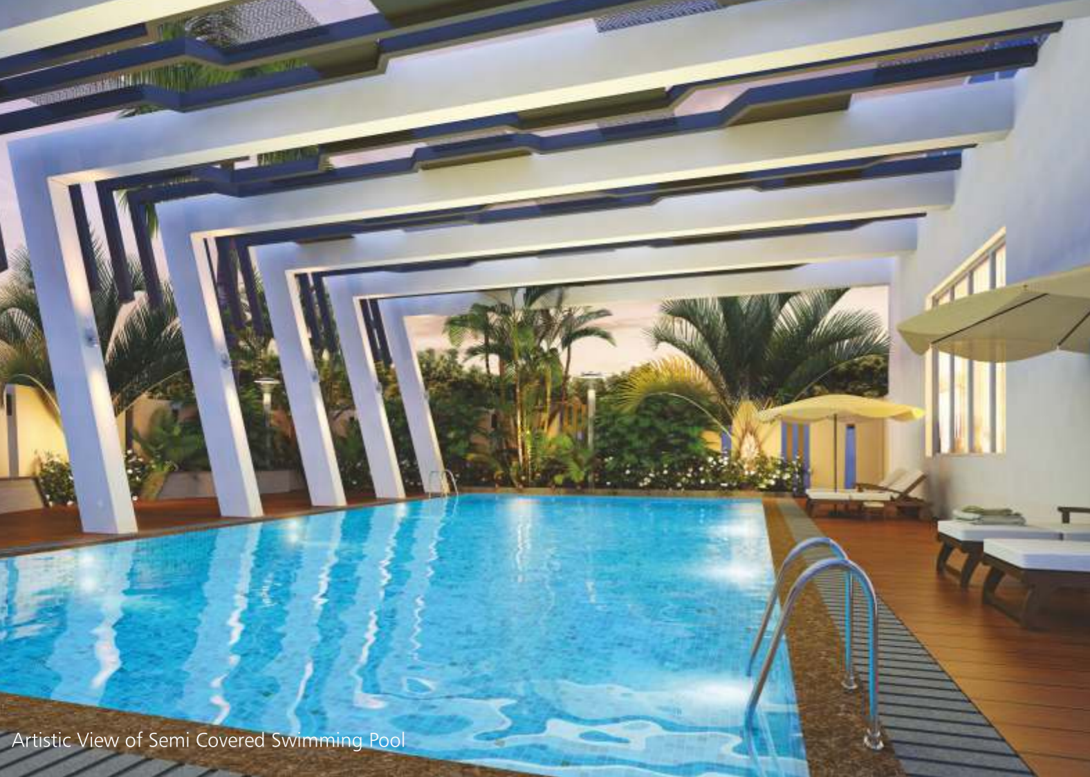
Artistic View of Semi Covered Swimming Pool