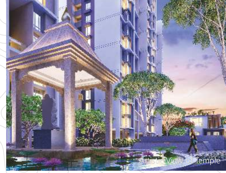
Artistic View of Temple