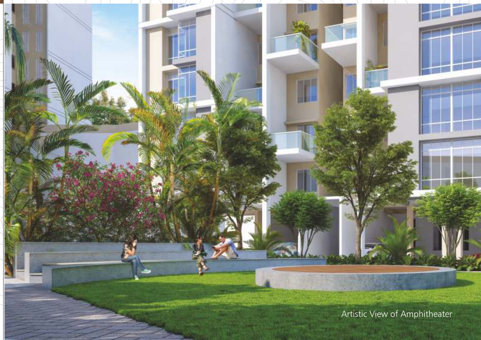
Artistic View of Amphitheater