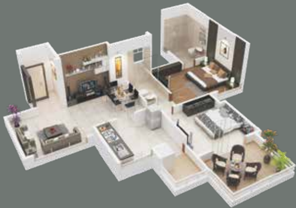
2 BHK Luxurious Apartment