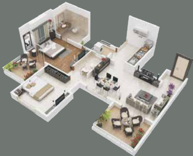
2 BHK Luxurious Apartment