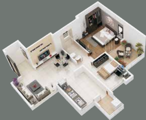
Compact 2 BHK Apartment