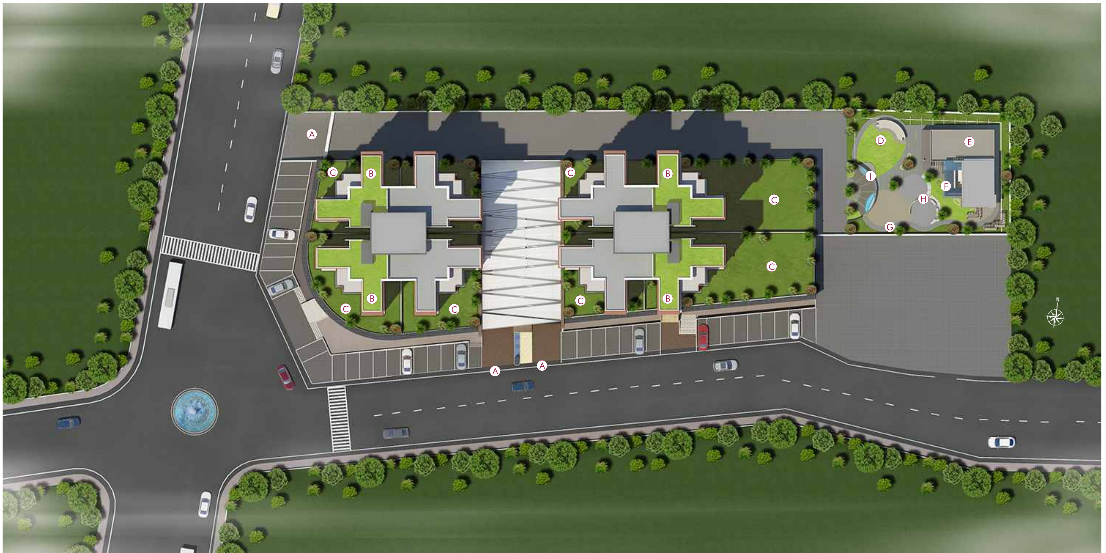
— SITE LAYOUT