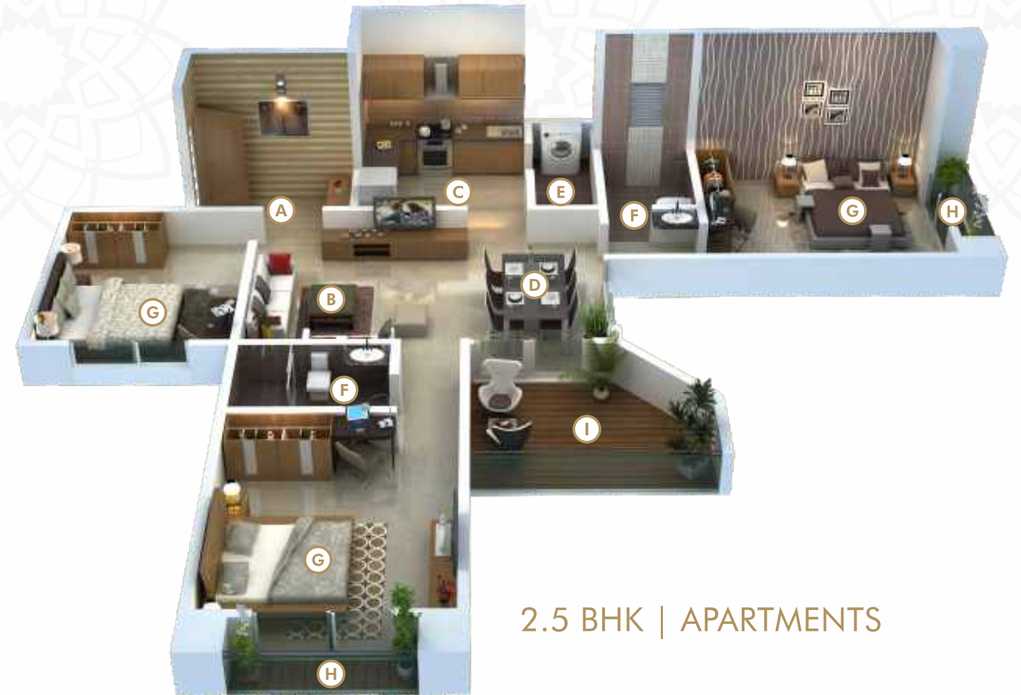
2.5 BHK | APARTMENTS