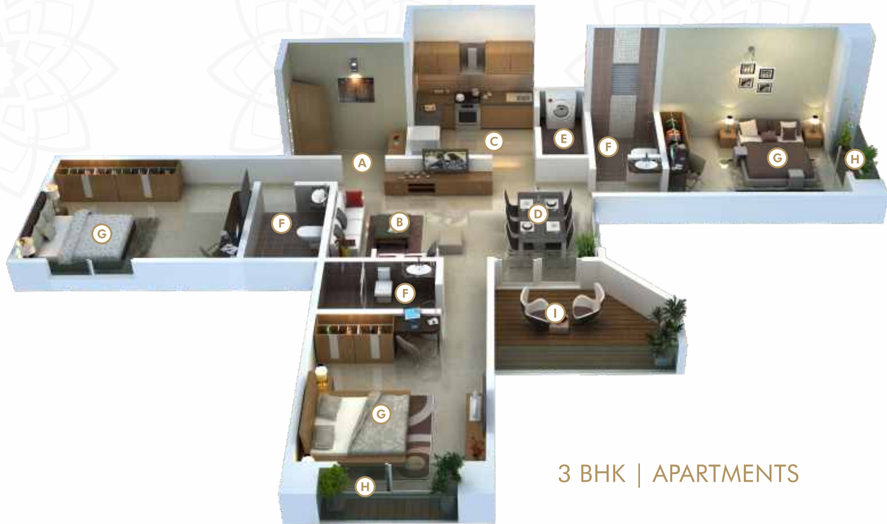
3 BHK | APARTMENTS