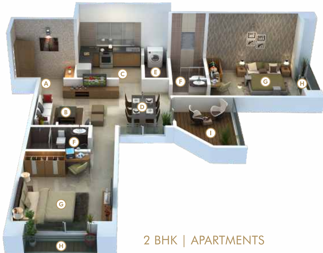
2 BHK | APARTMENTS