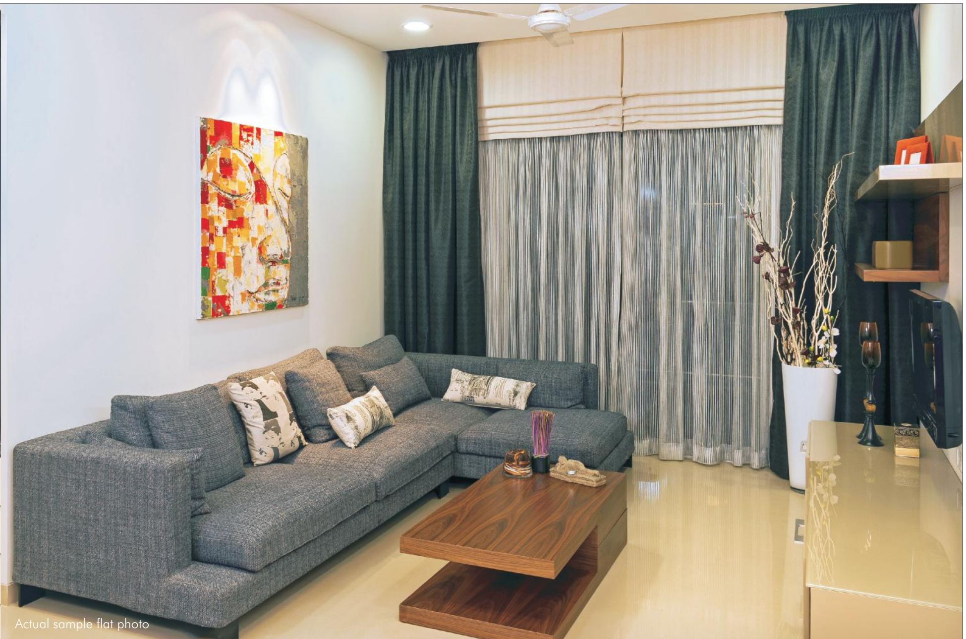
Actual sample flat photo