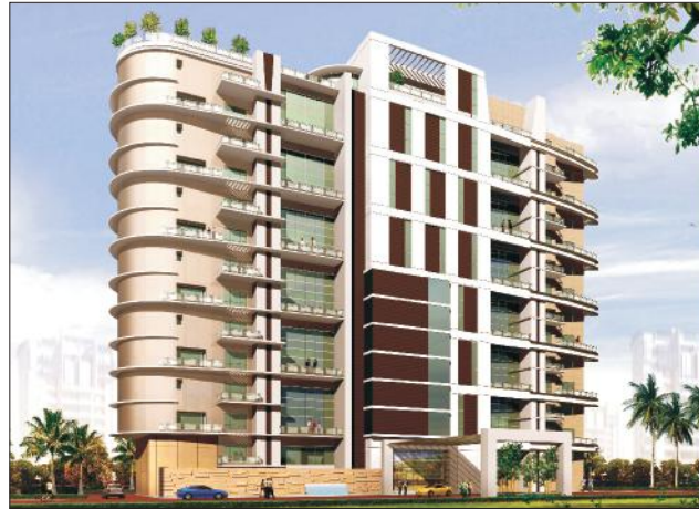
Konark A Plus, Empress County, Pune