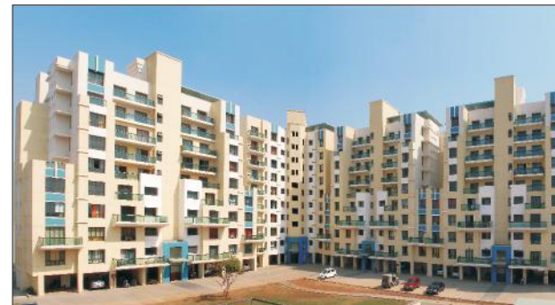
Konark Splendour, Vadgaonsheri Pune