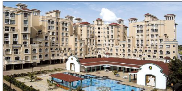
Konark Campus, Viman Nagar, Pune