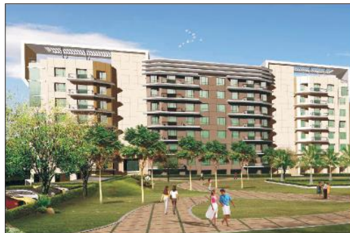
Konark Exotica, Wagholi, Pune