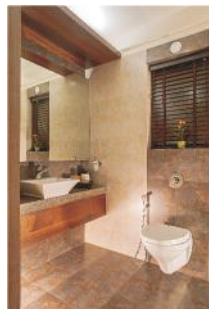
Actual sample flat photo