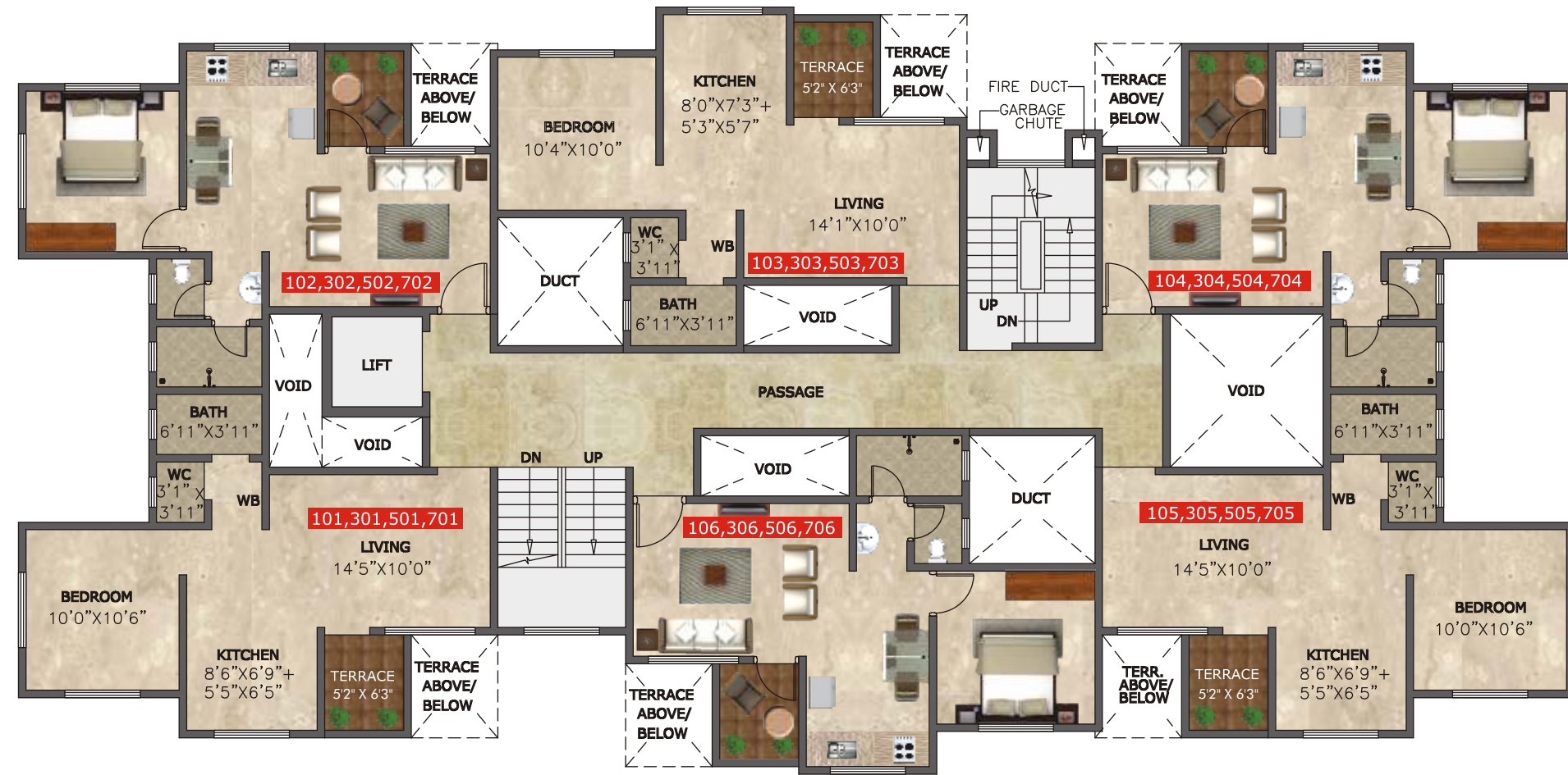
TYPICAL FLOOR PLAN 1st, 3rd, 5th & 7th