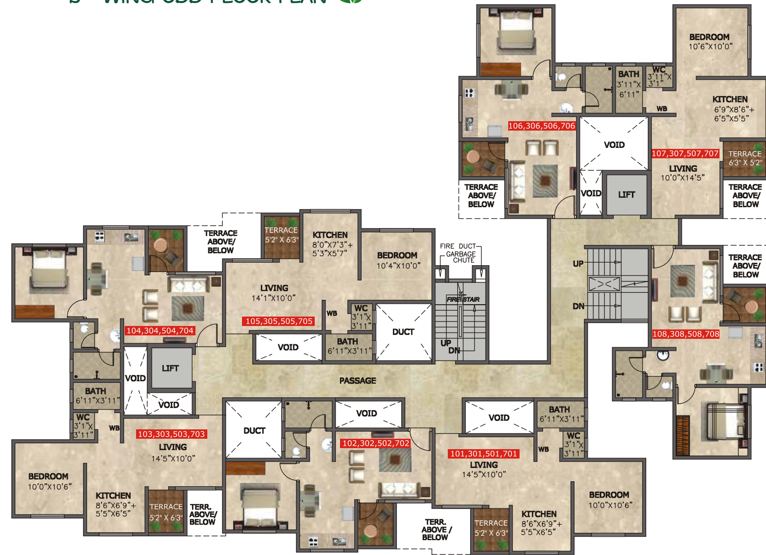
TYPICAL FLOOR PLAN 1st, 3rd, 5th & 7th