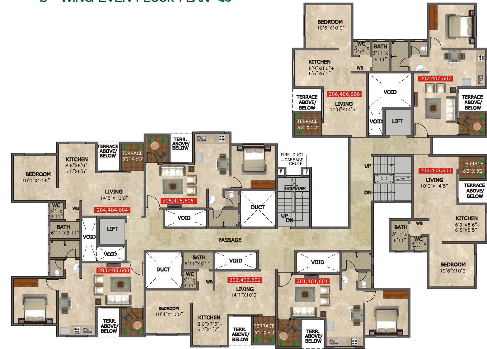
EVEN FLOOR PLAN 2nd, 4th & 6th