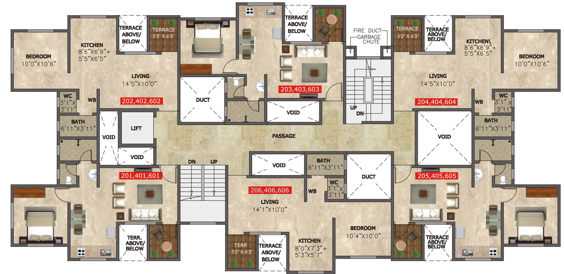
EVEN FLOOR PLAN 2nd, 4th & 6th