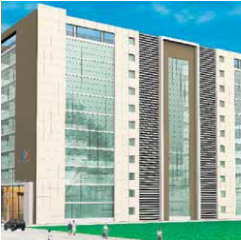
PRIDE ICON PUNE