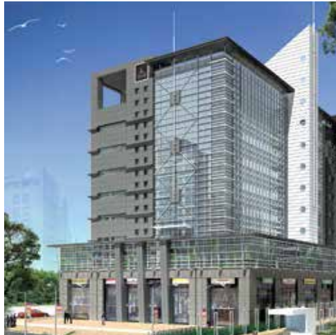
PRIDE HULKUL BANGALORE