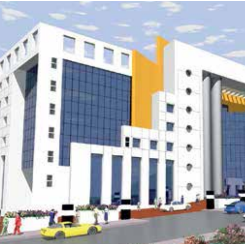
SILICON PLAZA PUNE