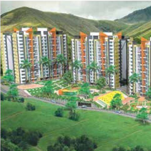
PRIDE PLATINUM PUNE