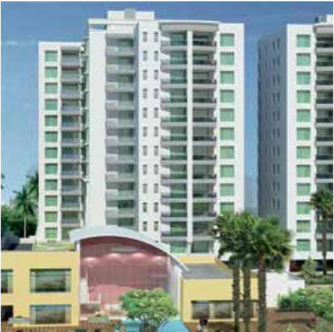
PARK TITANIUM PUNE