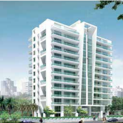
PRIDE PICASSA BANGALORE