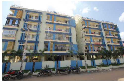
LVS Elegance T C Palya Main Road, K R Puram, Bangalore