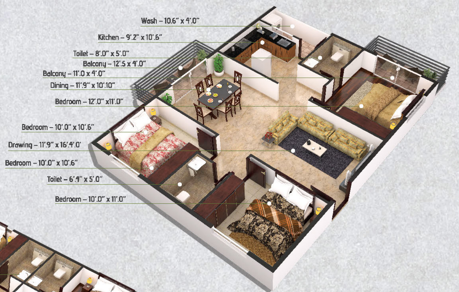
Flat 5 | 3 BHK | 1405 sft | West