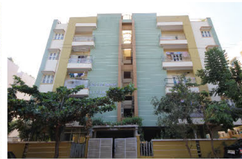
LVS Lavender Behind Manyata Tech Park, Tannisandra, Bangalore