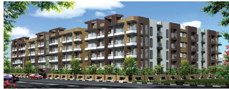
LVS Excellency T C Palya Main Road, K R Puram, Bangalore