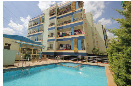
LVS Elite T C Palya Main Road, K R Puram, Bangalore