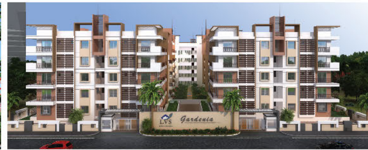
LVS Gardenia (Phase I) Halehalli Village, Kithaghnur & Maragondanahalli Main Road, K R Puram, Bangalore