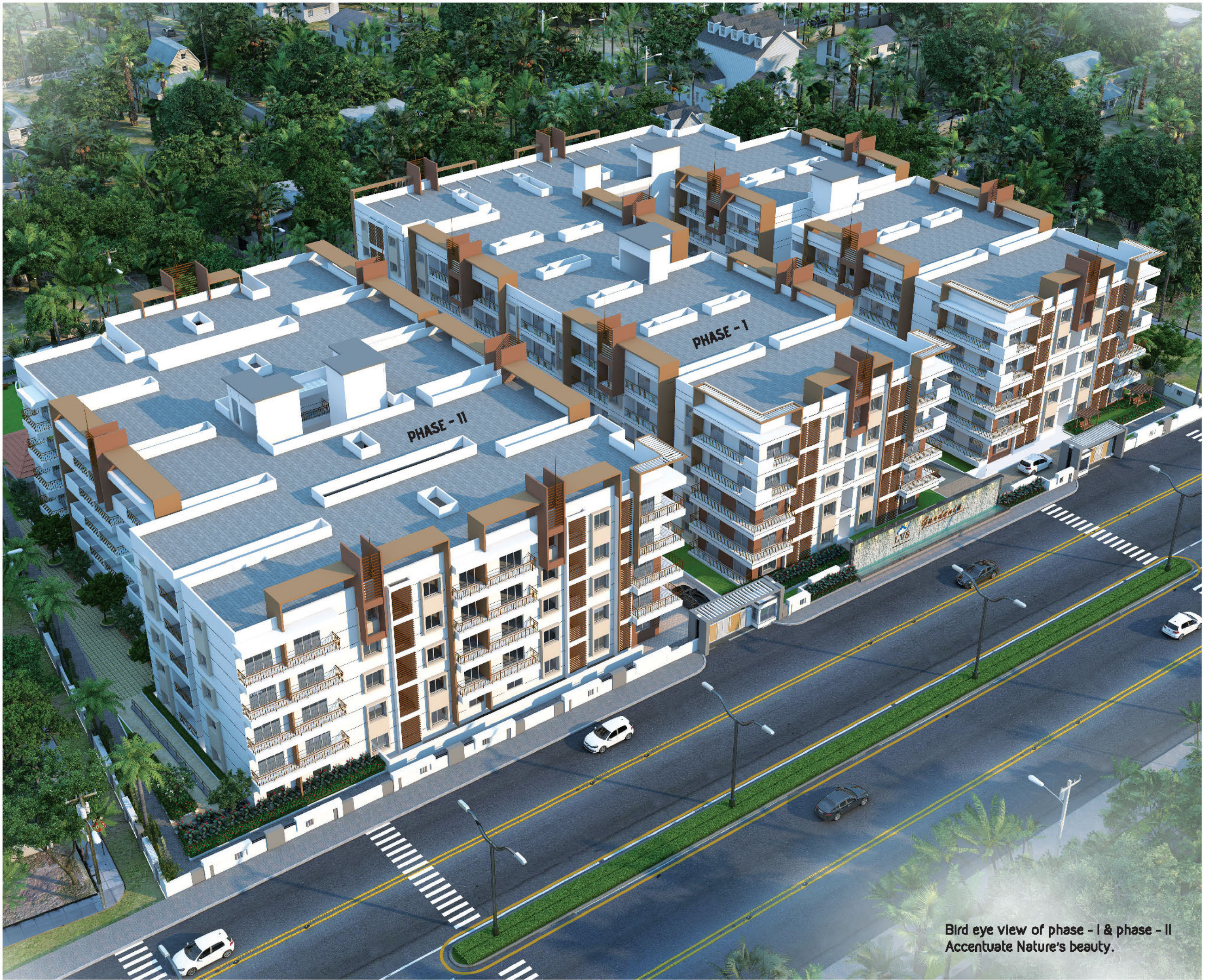
Bird eye view of phase - I & phase - II Accentuate Nature's beauty.