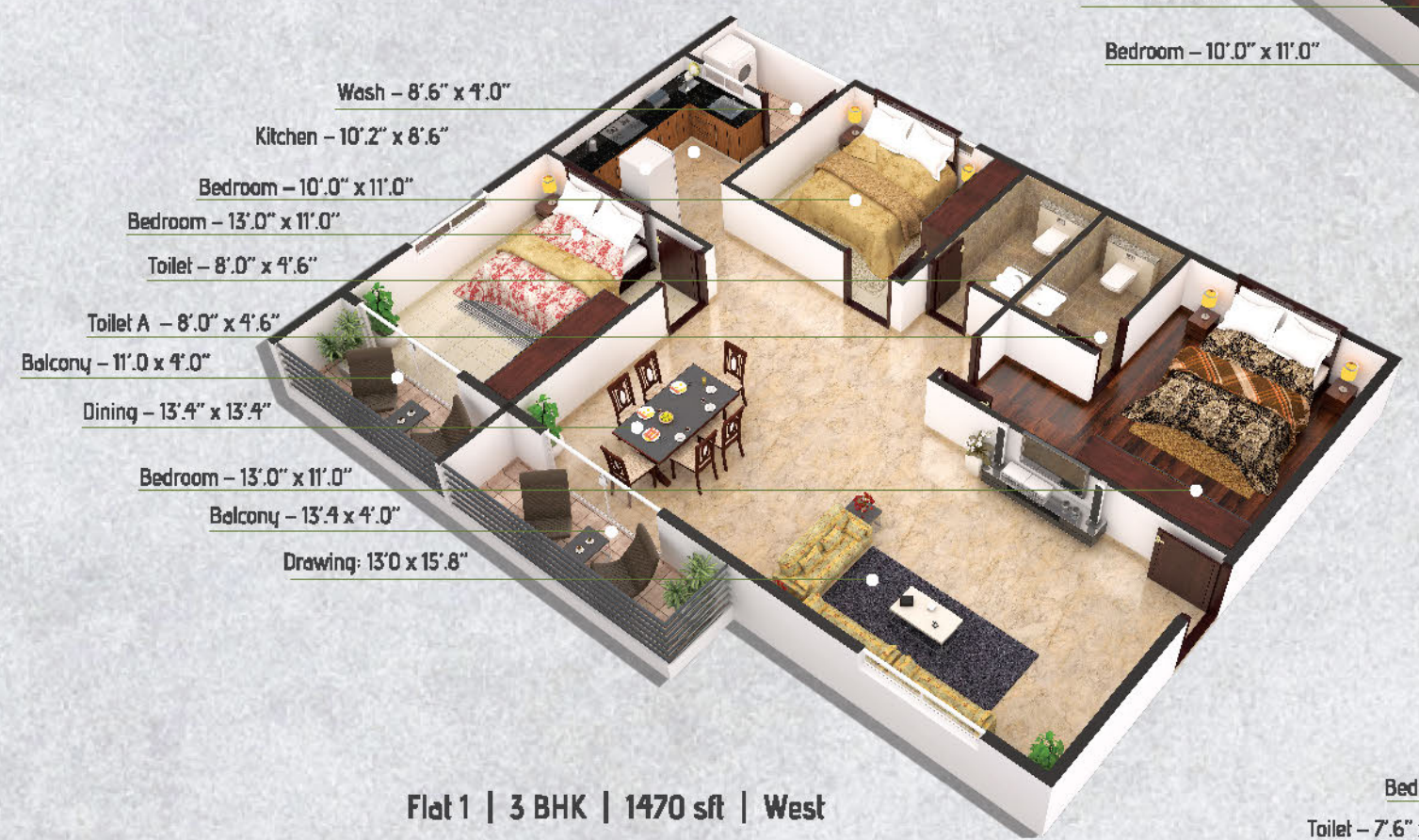
Flat 1 | 3 BHK | 1470 sft | West