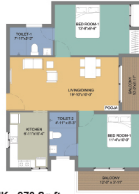
2 BHK - 970 Sq.ft