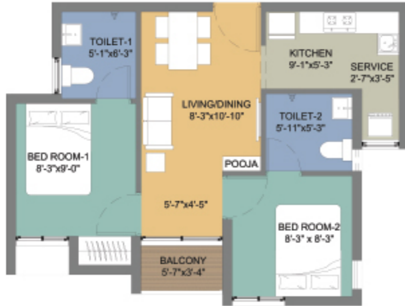
2 BHK - 610 Sq.ft