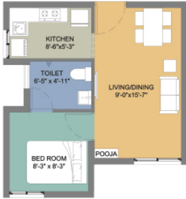
1 BHK - 430 Sq.ft