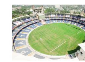
D.Y. Patil Stadium