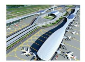
Upcoming International Airport