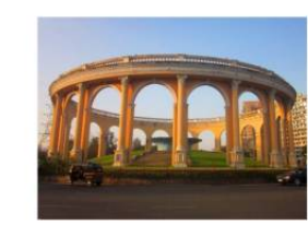
Utsav Chowk Kharghar