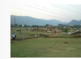
Kharghar Central Park