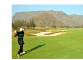
Kharghar Valley Golf Course