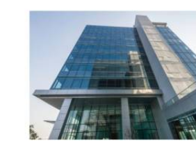
Upcoming Navi Mumbai Corporate Park