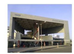
Kharghar Railway Station