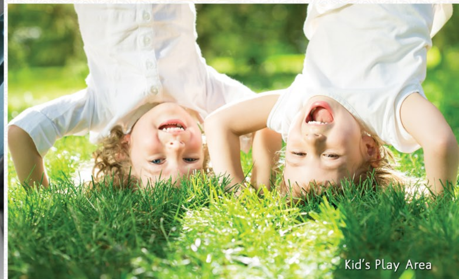
Kid's Play Area

Leaves of happiness. Flowers of cheer. Surrounded by greens, you feel healthier. You become active and fitter. Experience a lifestyle that is both active and soothing. It's amazing how 15 minutes in the gymnasium can change your day... Indoor games sweat you less but excite you just as much. Table tennis, Carom... make everyone younger. Cherish the moments.