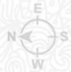
5th, 7th & 9th Floor