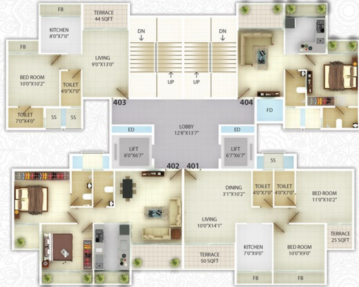
4th, 6th, 8th & 10th Floor