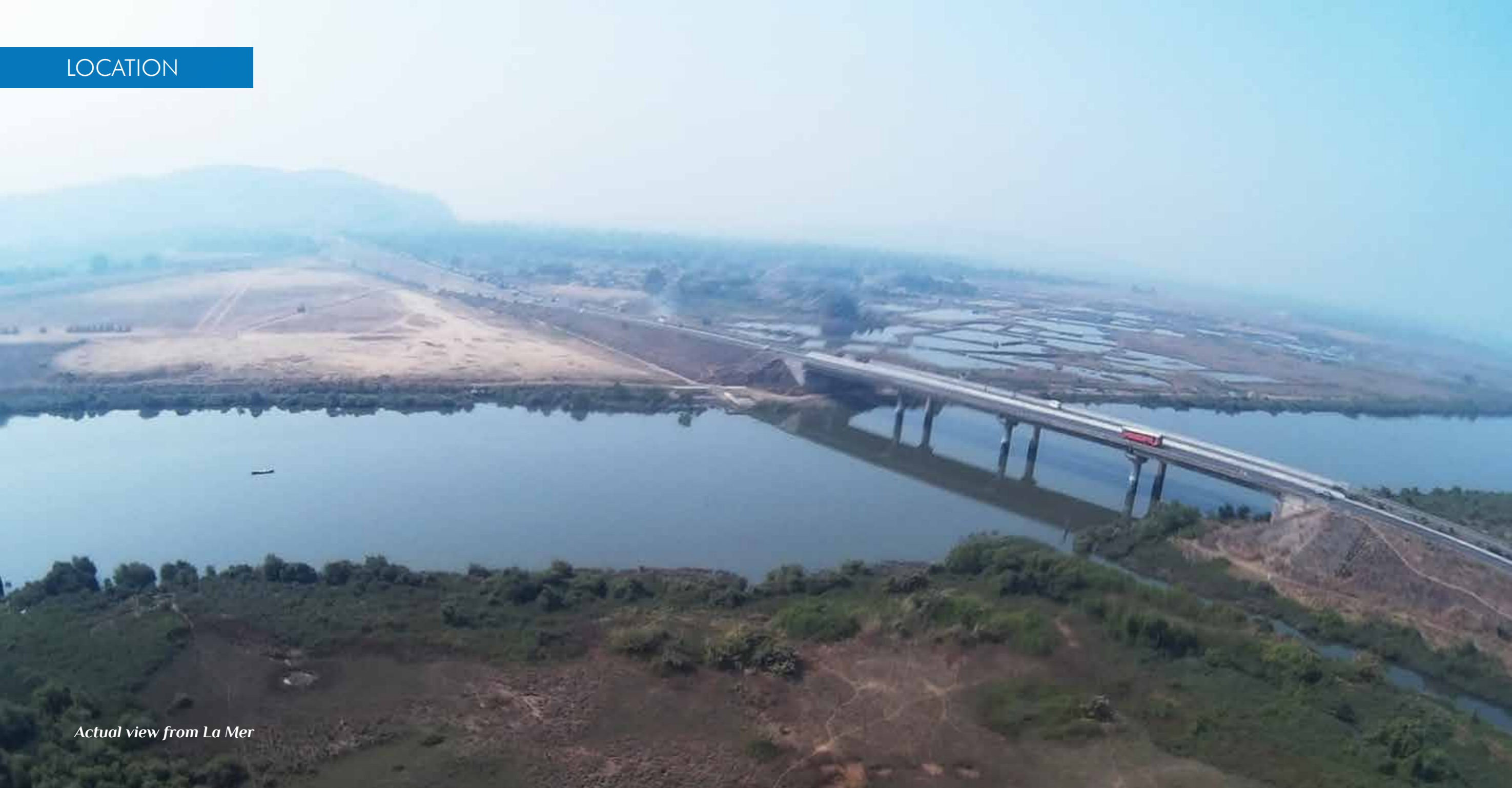
Actual view from La Mer