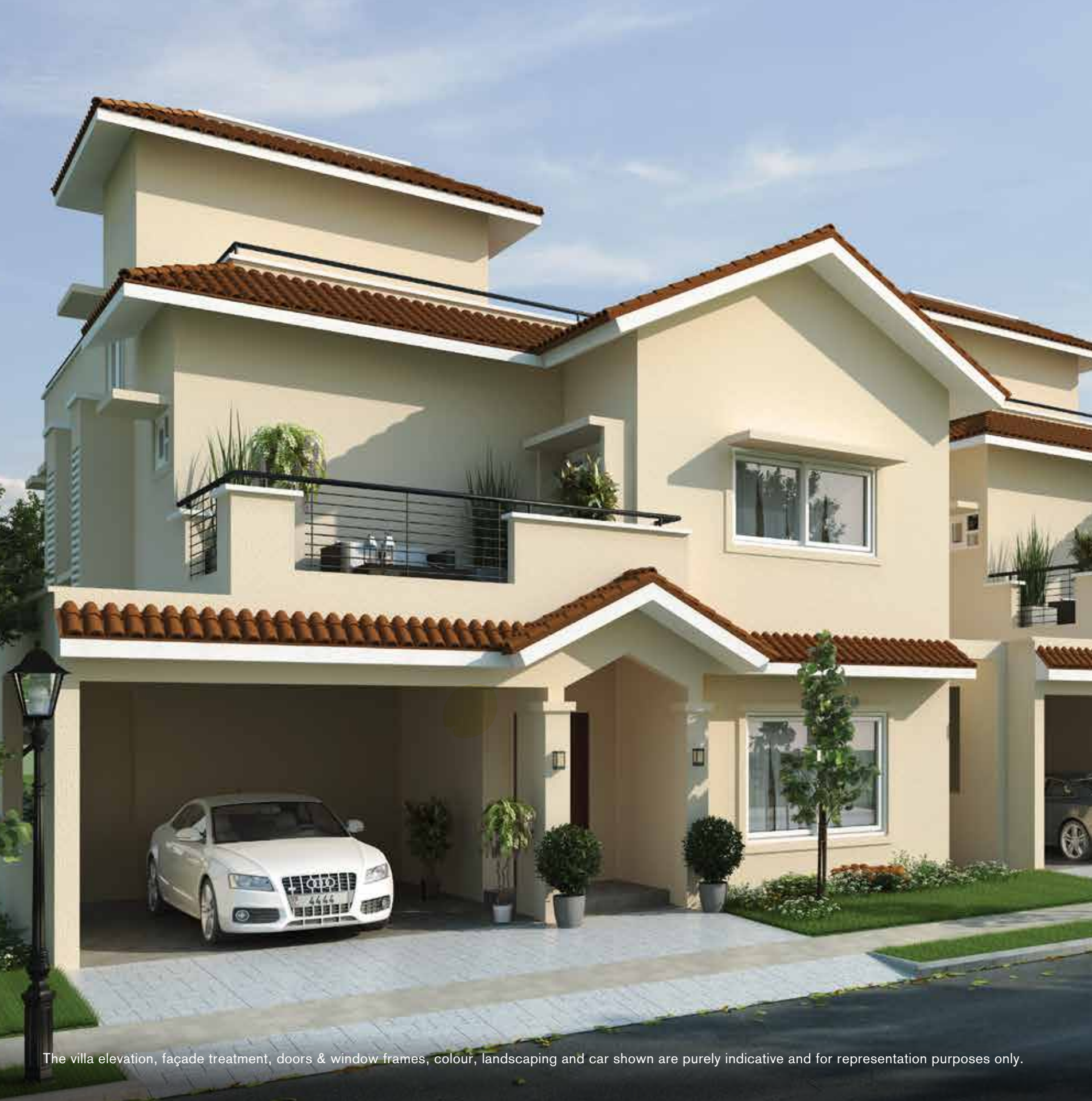
The villa elevation, façade treatment, doors & window frames, colour, landscaping and car shown are purely indicative and for representation purposes only.